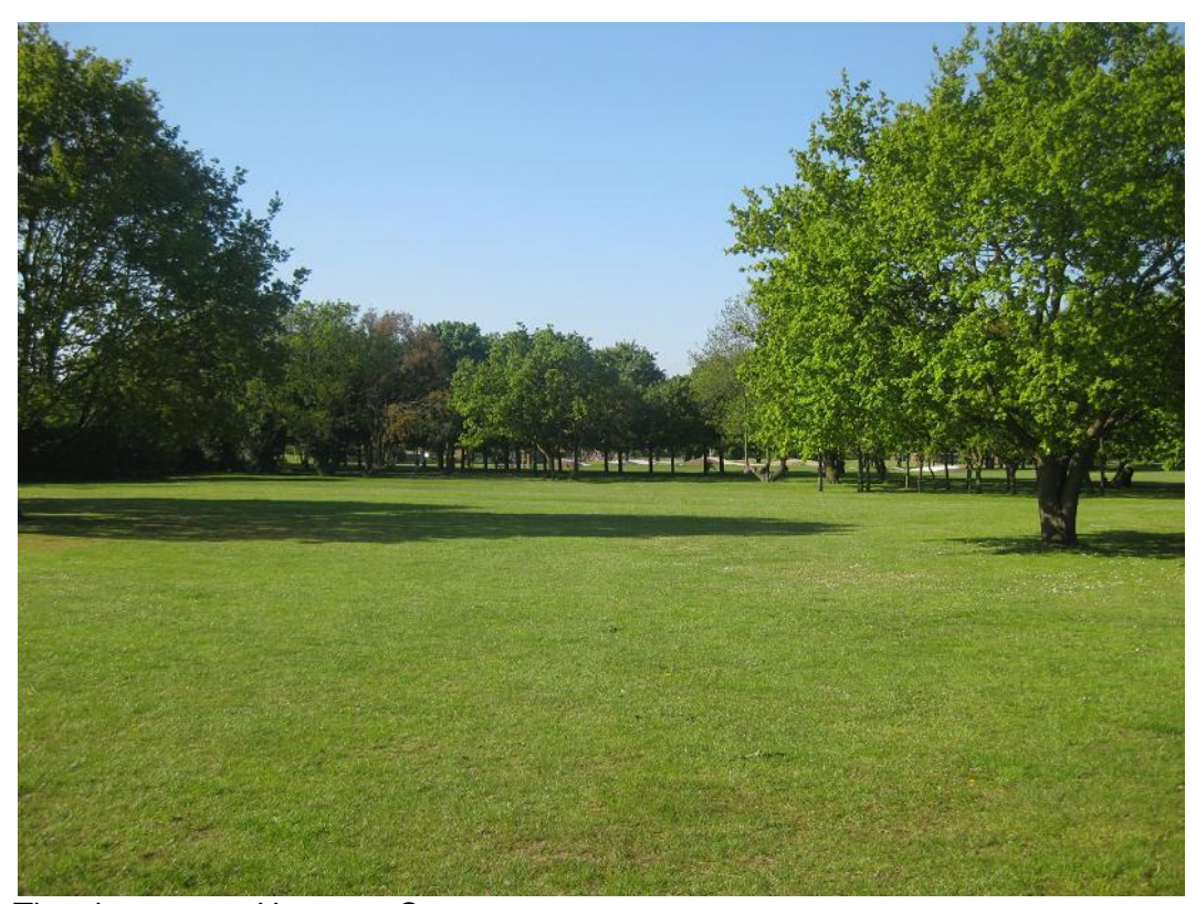
The view across Hampton Common