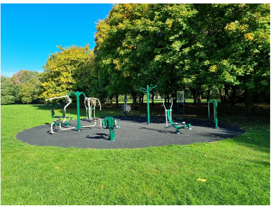
New Outdoor Gym June 2022