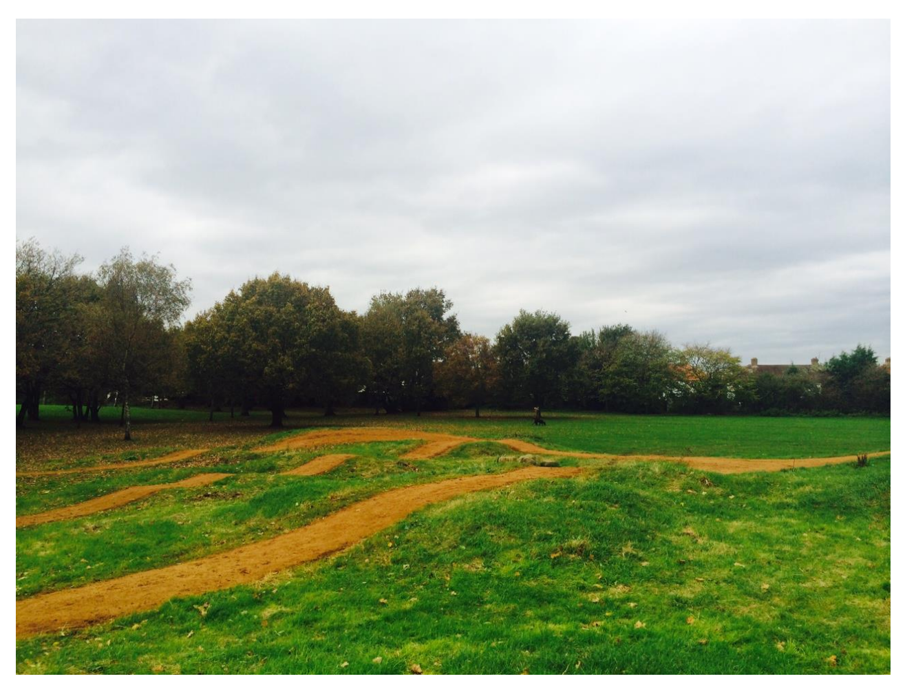
BMX Track upgrade