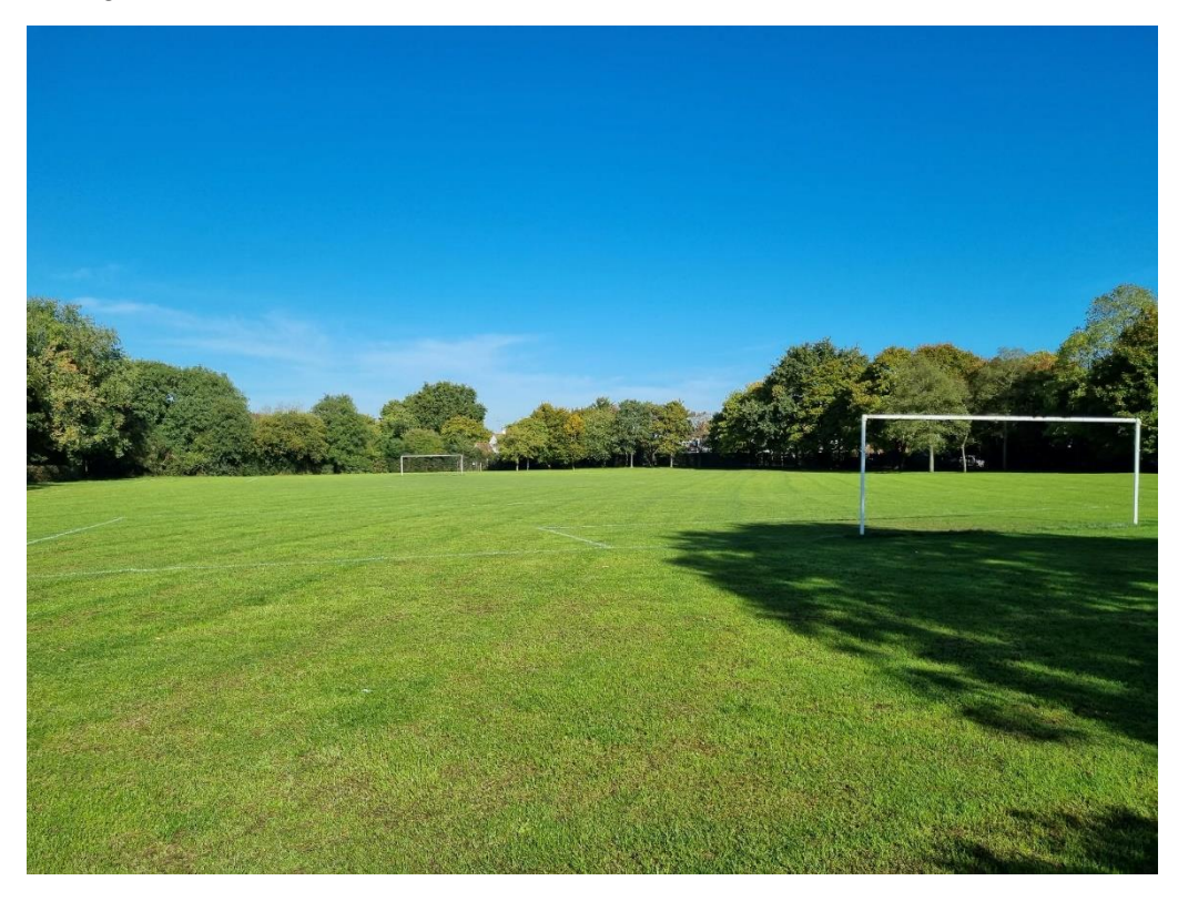
11v11 Pitch July 2023

The football pitches are all maintained by contractors. In addition to regular mowing, the contractors undertake pitch marking, sports bookings and pitch renovations during and at the end of each season.