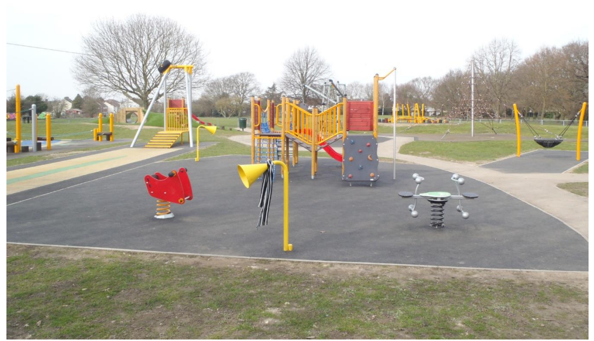
Play area upgrade 2014

<u>Latest parks updates - London Borough of Richmond upon Thames</u>