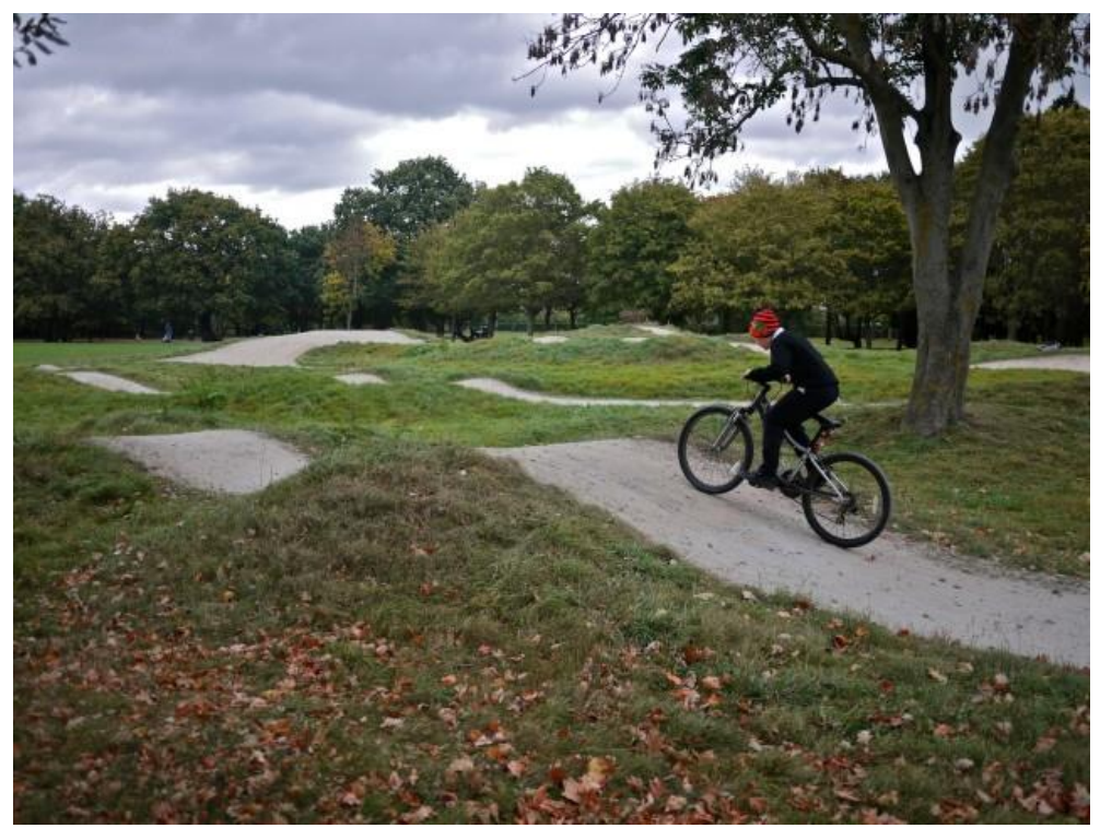
BMX track at Hampton Common

The BMX track is inspected on a daily basis by the contractor operative and monthly by RSS contractors. There are regular thorough checks of the facility and an annual inspection against ROSPA standards.