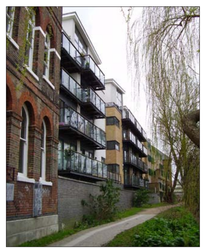
1. Building frontage to the riverside walk