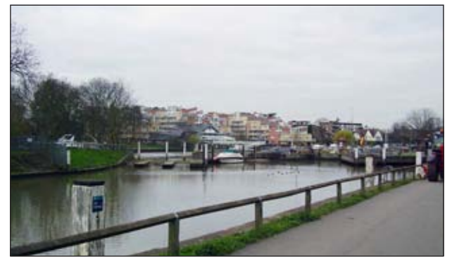
1. Building line steps up from the river