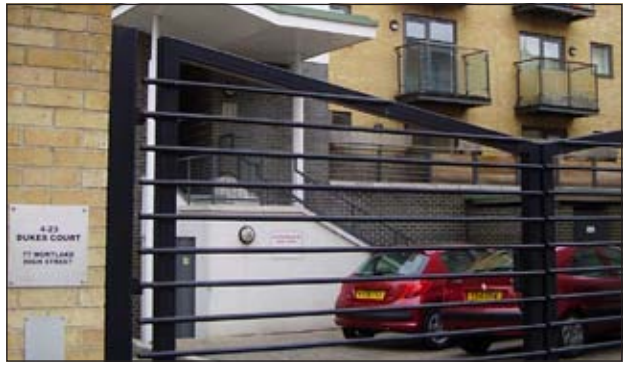
3. Designated parking spaces