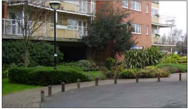
4. High quality landscape proposals are well maintained