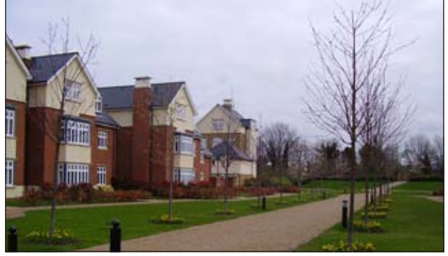
4. High quality laid out landscape proposals