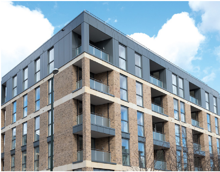
Bessant Drive, PA Housing

2026 Affordable Homes Programme when the prospectus is published (expected November/ December 2020). Following the Mayoral elections in 2022, the Council will continue to lobby for our affordable housing needs to ensure the Borough receives an equitable and fair proportion of future investment programmes.