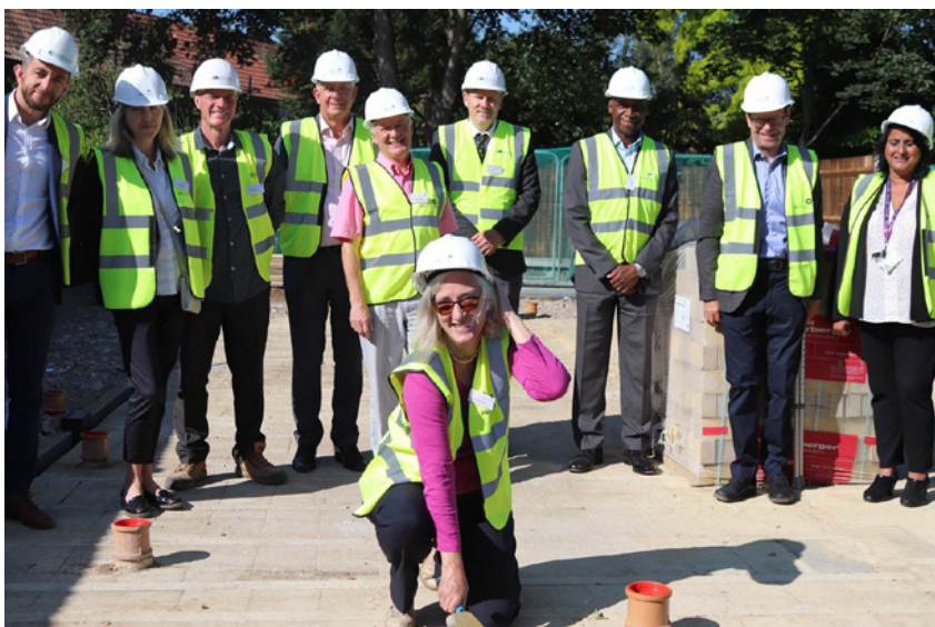
Laying the first bricks at the Craig Road supported housing development

The Borough has around 10,000 social housing units; this represents the fifth lowest social housing stock in London 4 and as at 1st April 2020 there were 4,100 applicants on the housing register. The high cost of market housing and scarcity of social housing in the Borough highlight the need for a range of affordable housing products to accommodate the needs of households on a range of incomes.