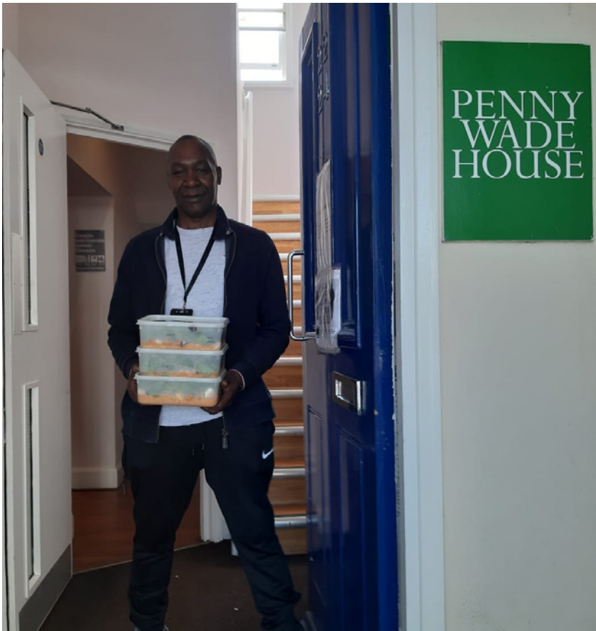
Delivering food parcels at Penny Wade House

Clinical Commissioning Group (CCG) colleagues and SPEAR to support the development of health services that meet the standards set out for Commissioners by the London Healthy Partnership for homeless people.