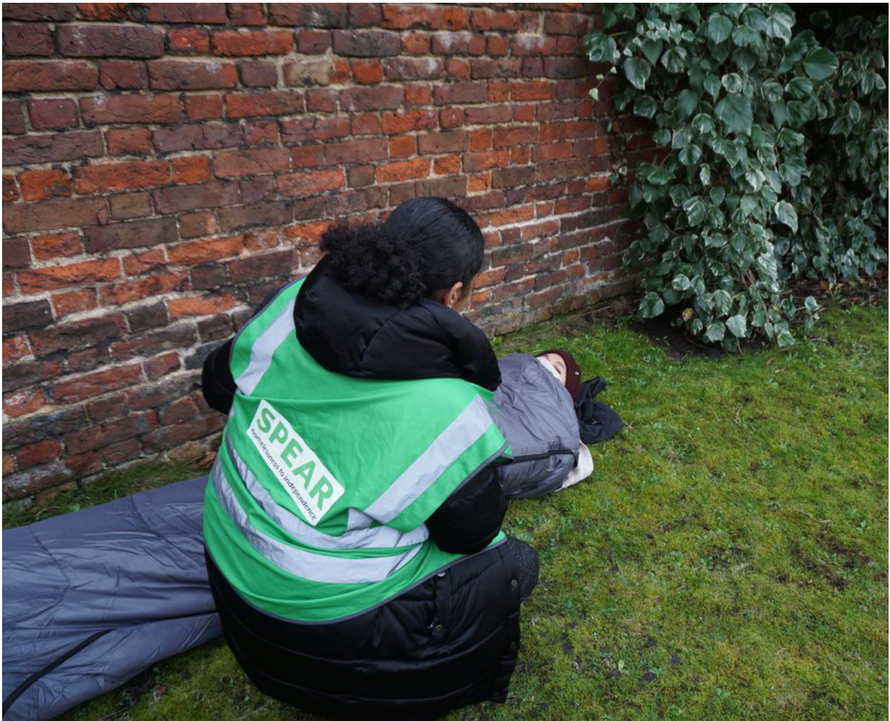
SPEAR delivers outreach services across the borough