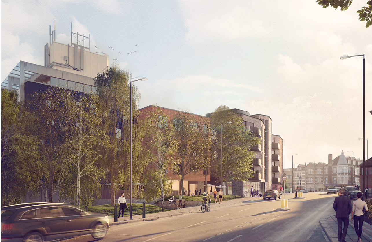
Informer House, RHP. Former newspaper offices will provide 22 shared ownership homes

other sites being prepared for planning application submissions. Where appropriate, the Council can look to achieve a greater number of affordable housing units by disposing of two sites at one time, one for high value market housing which is used to subsidise 100% affordable housing on the other site. Other options, such as land-swap arrangements with partner PRPs, repurposing individual properties, for instance as supported living projects, flexible use of financial resources, are also important in ensuring the Council maximises affordable housing delivery within the particular context of LBRuT.