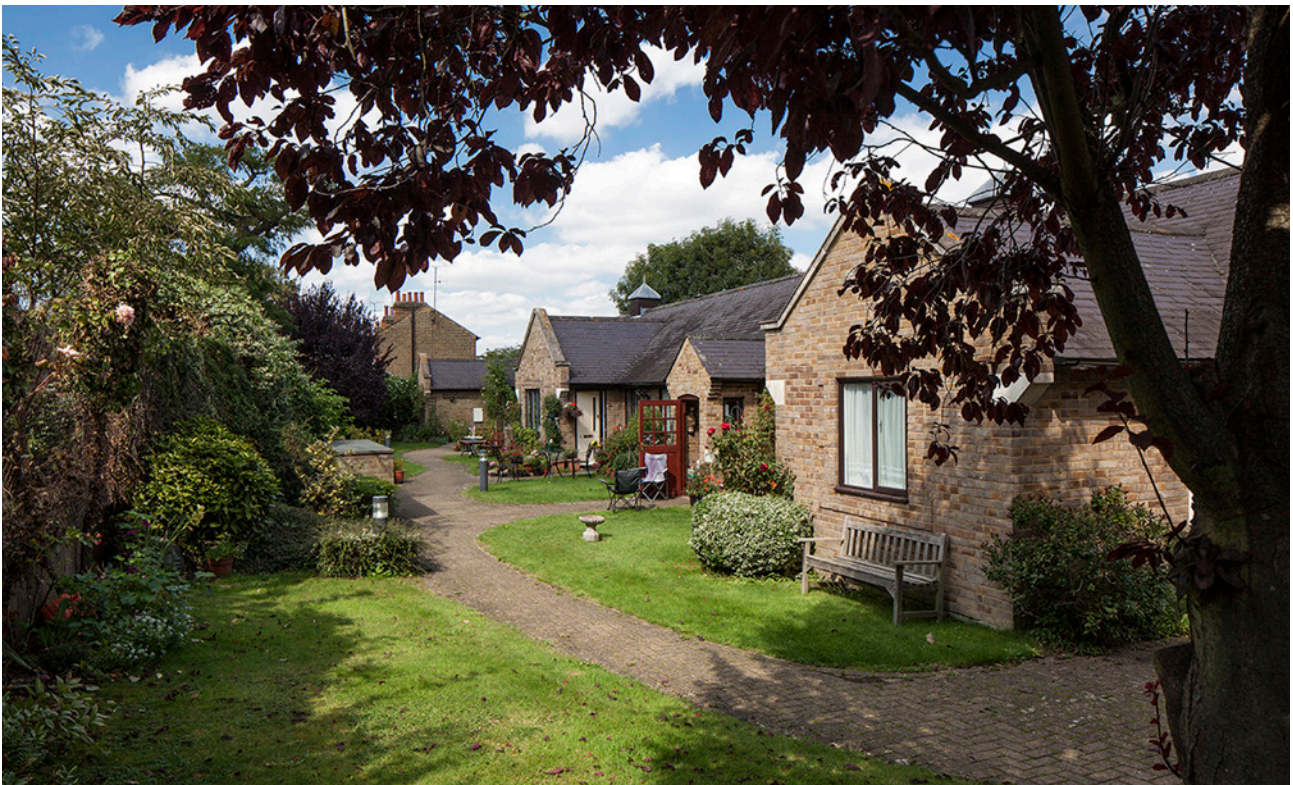
Clearwater House sheltered housing