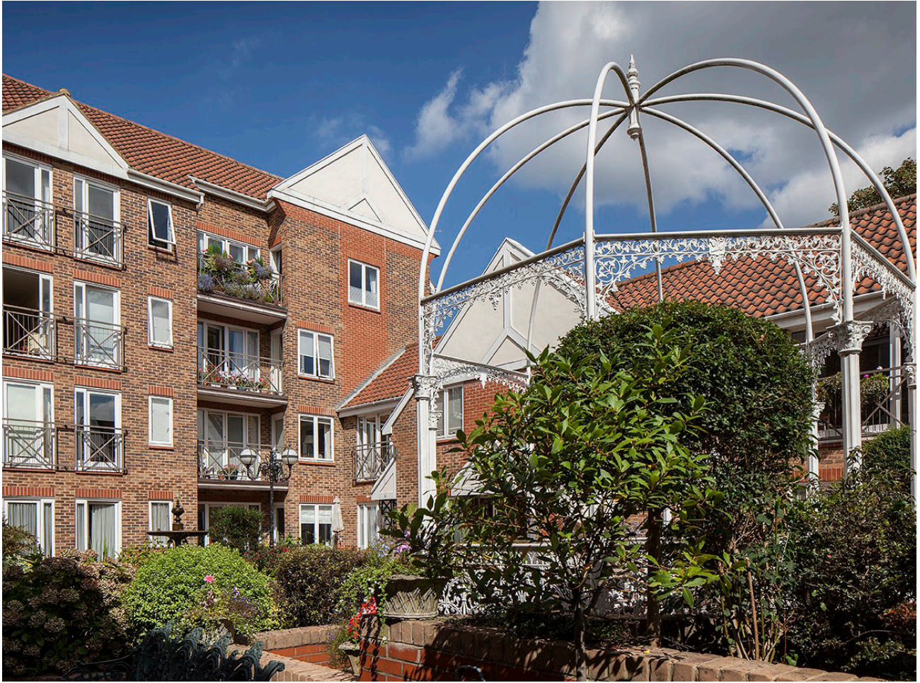
Northumbria Court sheltered housing