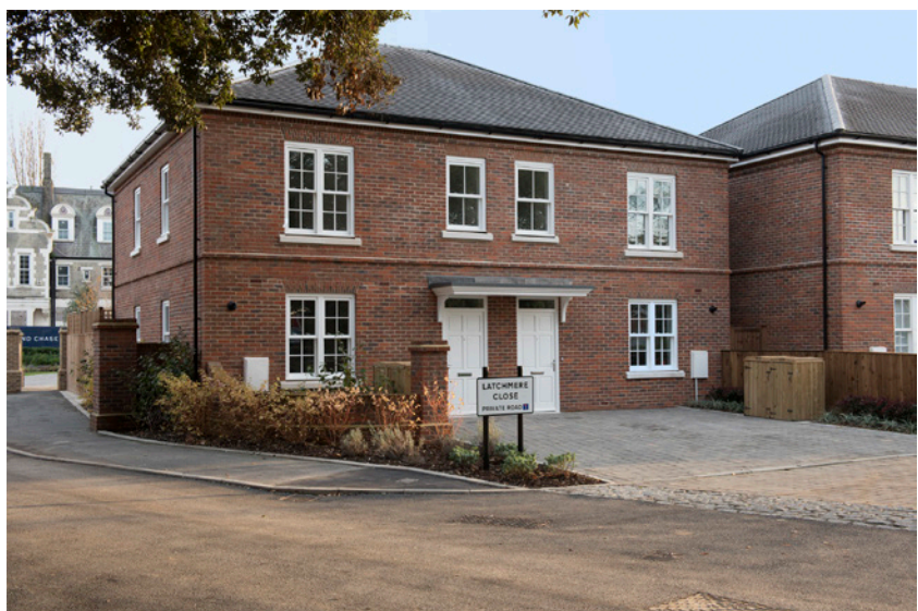
Latchmere Close, PA Housing