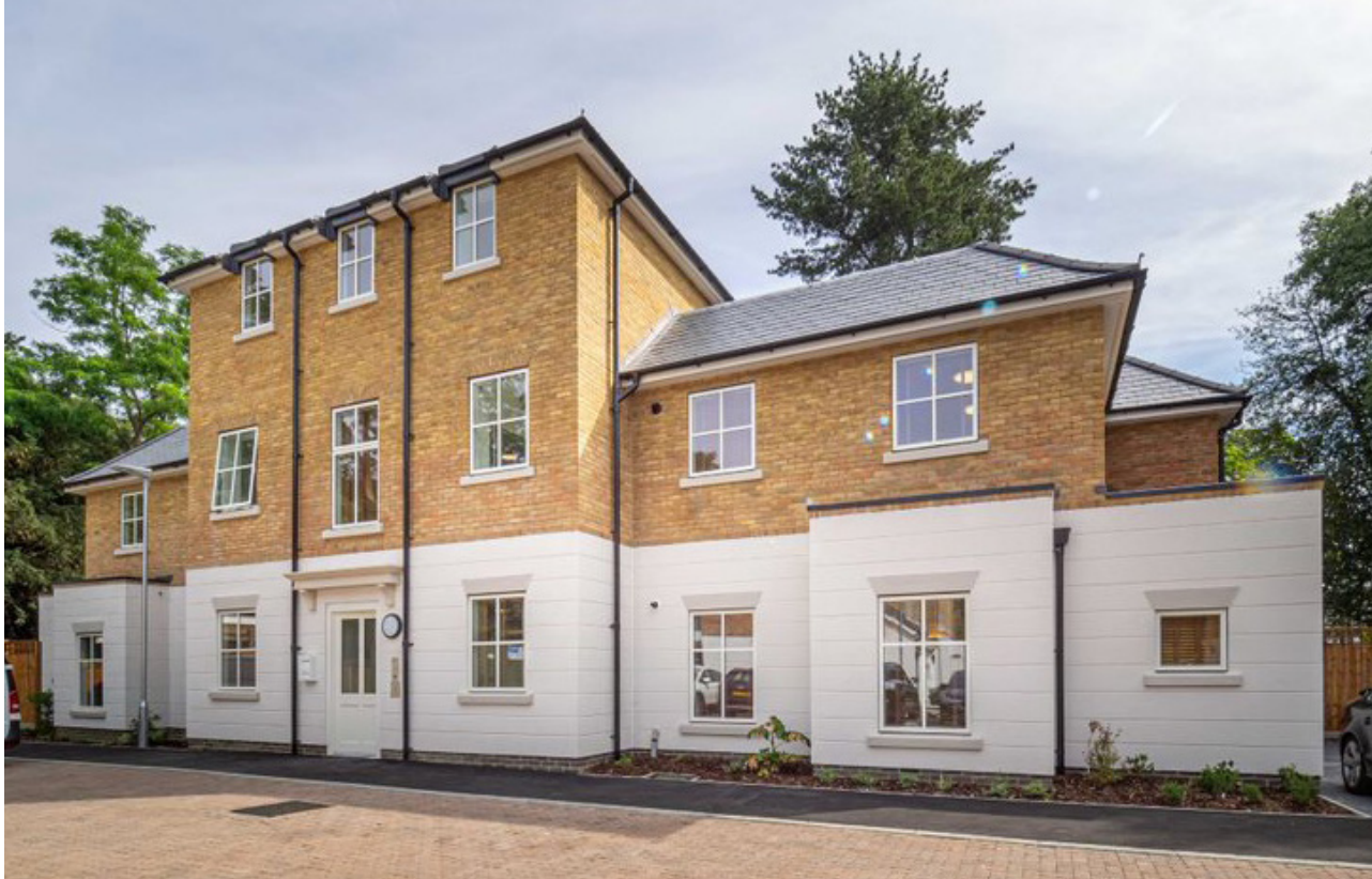
Haydon Close, RHP.

a local Councillor, for complaints resolution. The service aims to improve housing management standards and offers a mediation service to help resolve complex issues. The service is well regarded and valued by local PRPs and their residents.