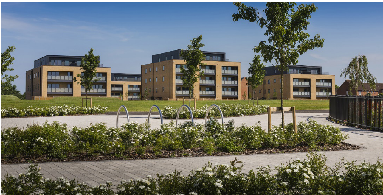
Fountains Close, RHP. Provides a mix of affordable rent and shared ownership