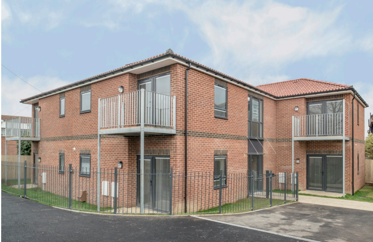
Badger House, social housing for clients of the Council's specialist autism services

be a need for additional extra care, nursing and residential places. The Council actively promotes extra care housing as an alternative to residential care, a position set out in its Market Position Statement 2018 . A need for additional 'dementia friendly' accommodation has also been identified. In 2017/18 a total of 152 people were in specialist dementia placements for some or part of the year and this number is projected to increase by at least 33% by 2035.