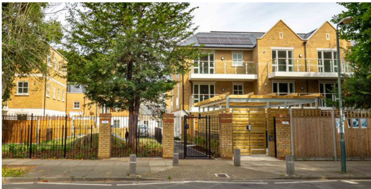
Haydon Close, RHP.

will be expected to sign up to. This will actively encourage members to conduct their activities in an environmentally, socially and economically responsible way. The Council has been successful in a bid for funding from the Green Homes Grant Local Authority Delivery grant which will be used to improve the energy efficiency of private rented and owned houses in the Borough. The Council has prioritised ensuring the necessary fire safety checks to housing stock across the Borough, both private and PRP housing, are undertaken. The Council supports PRPs' programmes of retrofitting sprinkler systems in its sheltered housing schemes and two high-rise blocks. In 2021 RHP will also be fitting a sprinkle system in the extra care scheme at Sandown Court and has started to specify sprinkler systems in most new buildings, ahead of this being a requirement under the GLA 2021 - 2026 funding programme. Locally, RHP is leading the way in such work