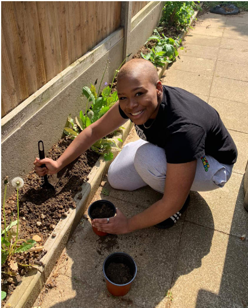
Gardening at SPEAR accommodation

a local connection. Maintaining local services targeted towards preventing and alleviating rough sleeping is a longstanding priority for the Council.