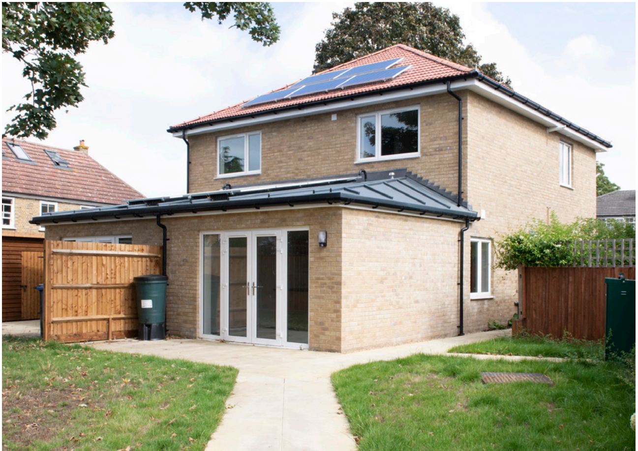
Craig Road supported housing for young people with learning disabilities and autism

ensure on-going support is in place from the Resettlement Team or AfC.