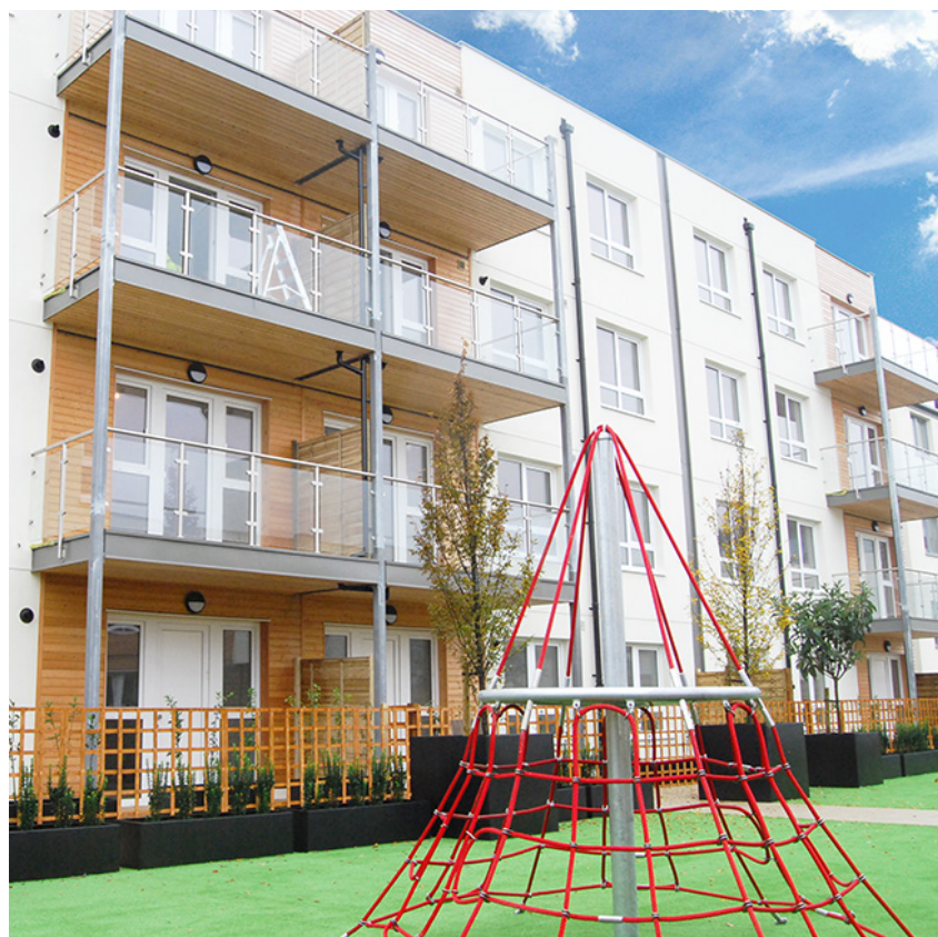
Dairy Court, RHP. Provides 31 affordable rent homes

The limited opportunity to develop on privately owned land necessitates a flexible and innovative approach to supporting the development of affordable housing in the Borough. The Council's asset disposal programme is a valuable source of new development opportunities and, having identified potential sites for disposal, the Council is committed to bringing these forward as development options for PRPs for wholly affordable housing; this should always be considered before disposal to private developers is agreed. One such site has already obtained planning consent for 100% affordable housing, delivering 30 affordable homes, with three