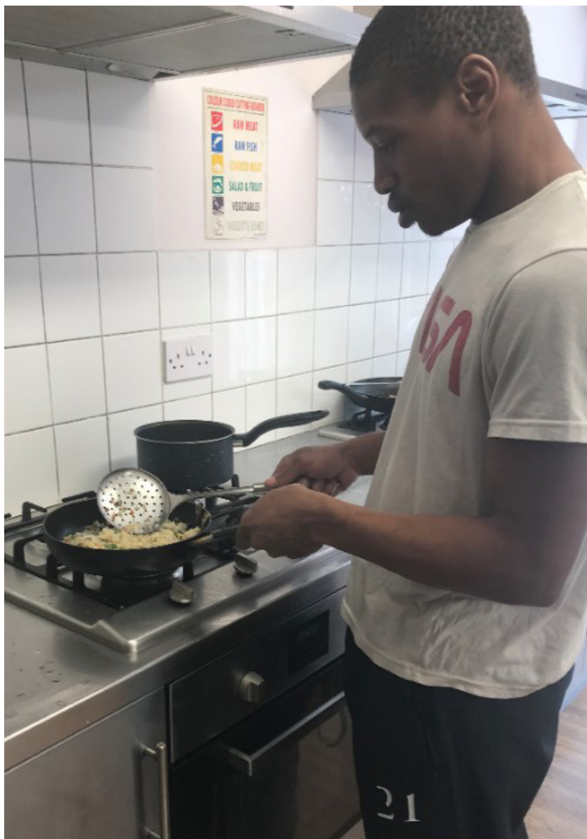
Developing cooking skills at Penny Wade House

The Government's national Rough Sleeping Strategy identifies the need for a holistic approach with a focus not only on housing issues but other factors which may contribute to someone ending up sleeping rough. The Strategy sets out three themes that LAs must focus on to work towards the Government's target of eradicating rough sleeping by 2027: prevention, intervention and recovery. During the coronavirus pandemic over 80 rough sleepers were provided