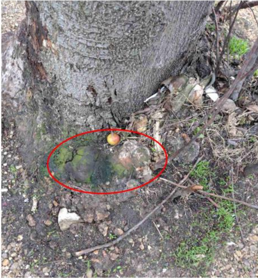
Images show fruiting body at base of stem circled in red.