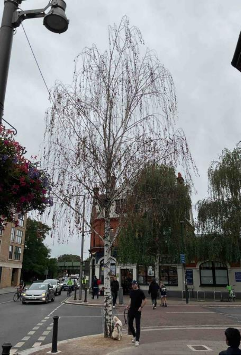
Image shows dead tree in street scene