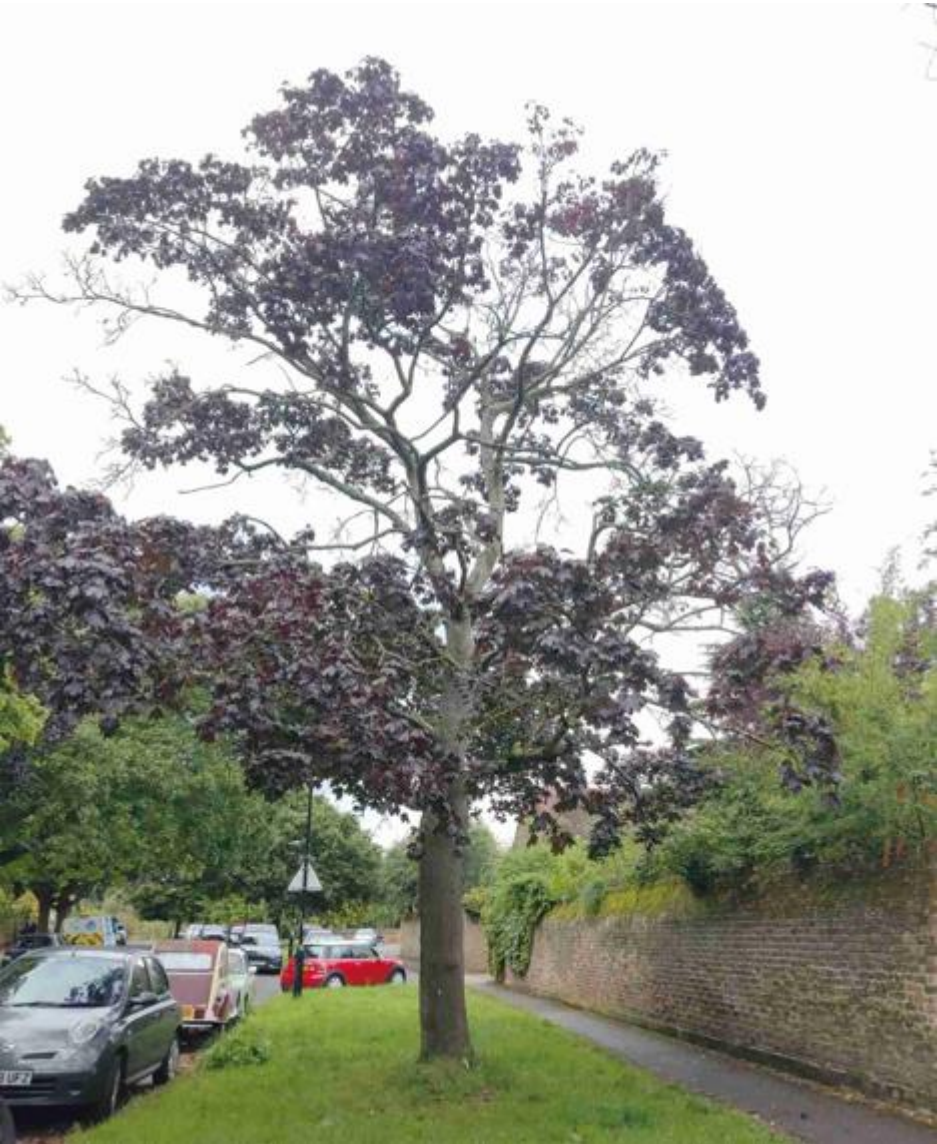
Image shows tree in street scene with crown dieback.