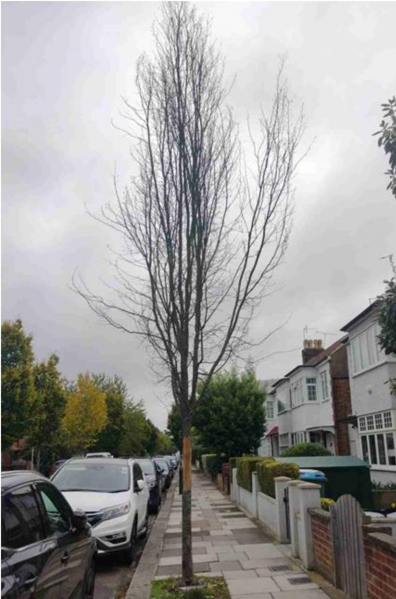
Image shows dead tree in street scene.