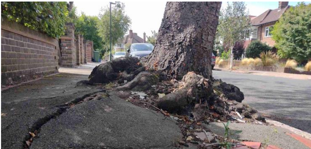
Image shows raised roots causing trip hazards and obstructing pavement.