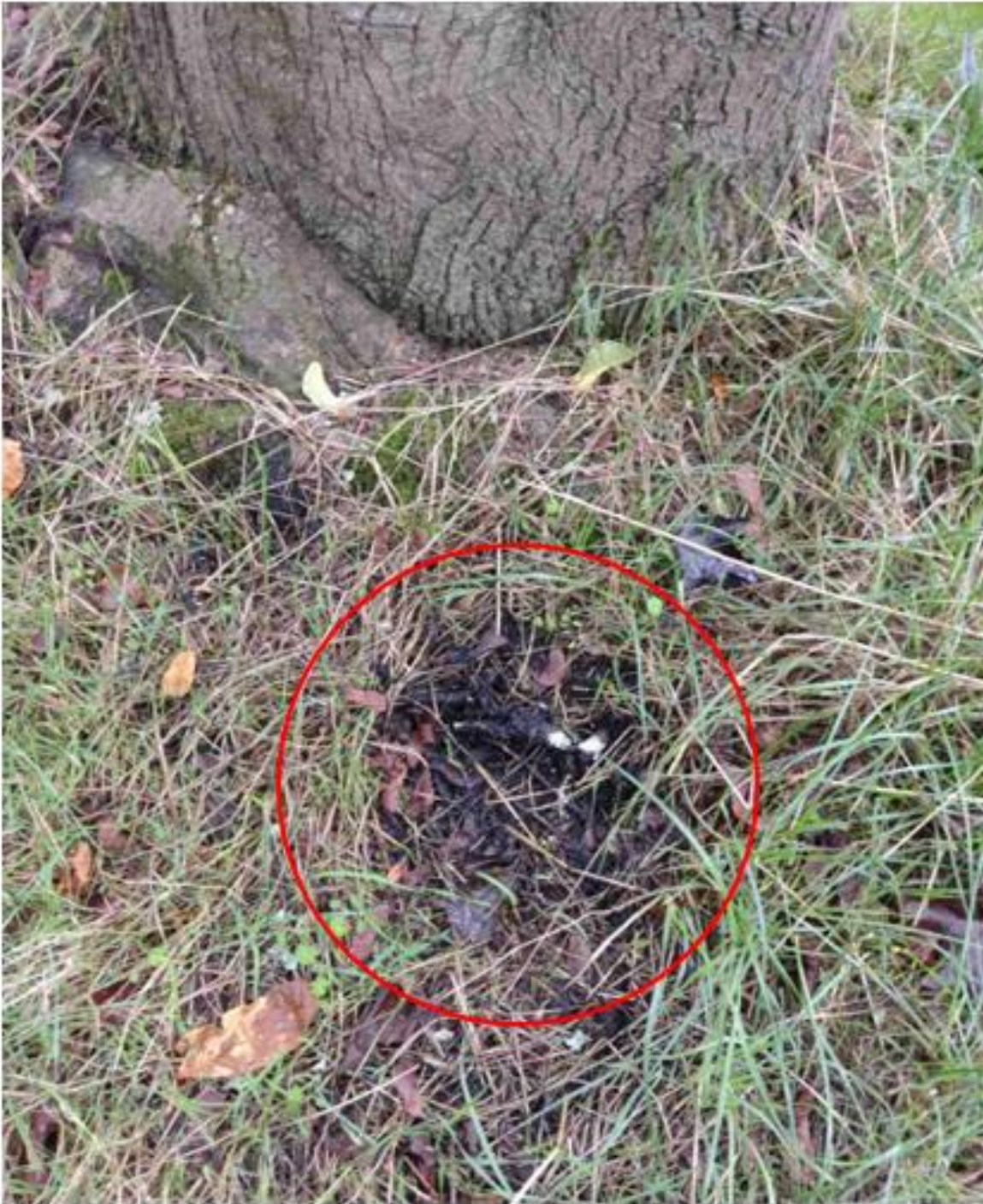
Image shows suspected Armillaria sp. fruiting bodies circled at base of trunk.