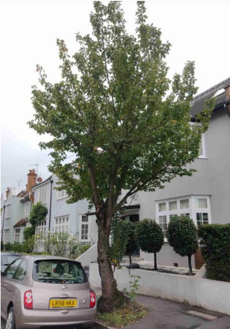
Image shows tree in street scene