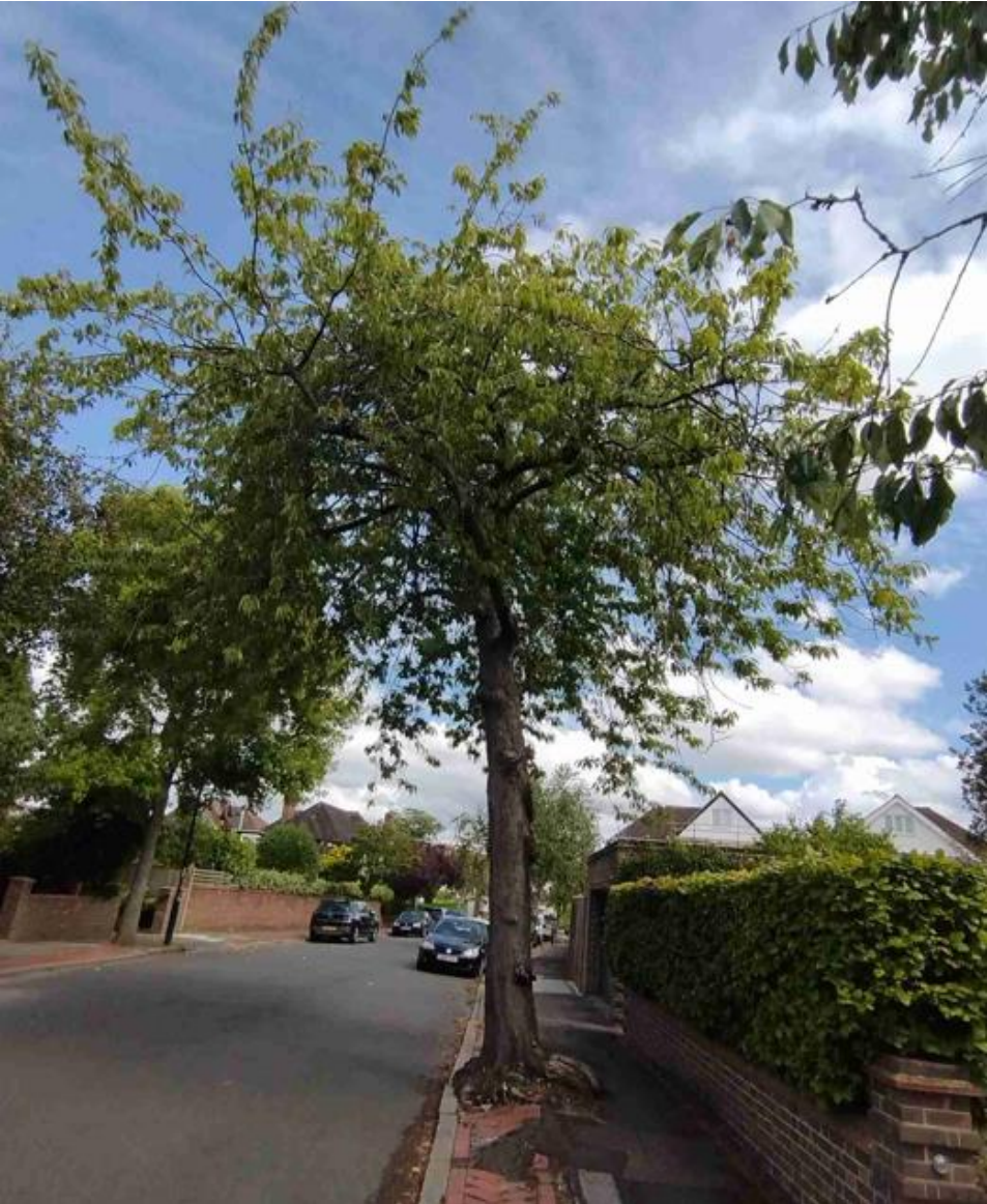
Image shows tree in street scene.