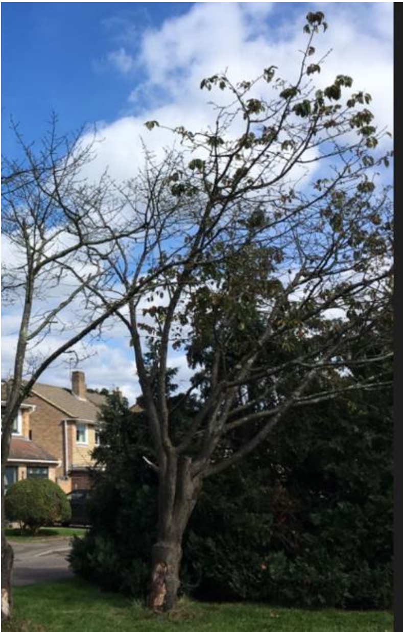
Image shows dead tree in street scene.