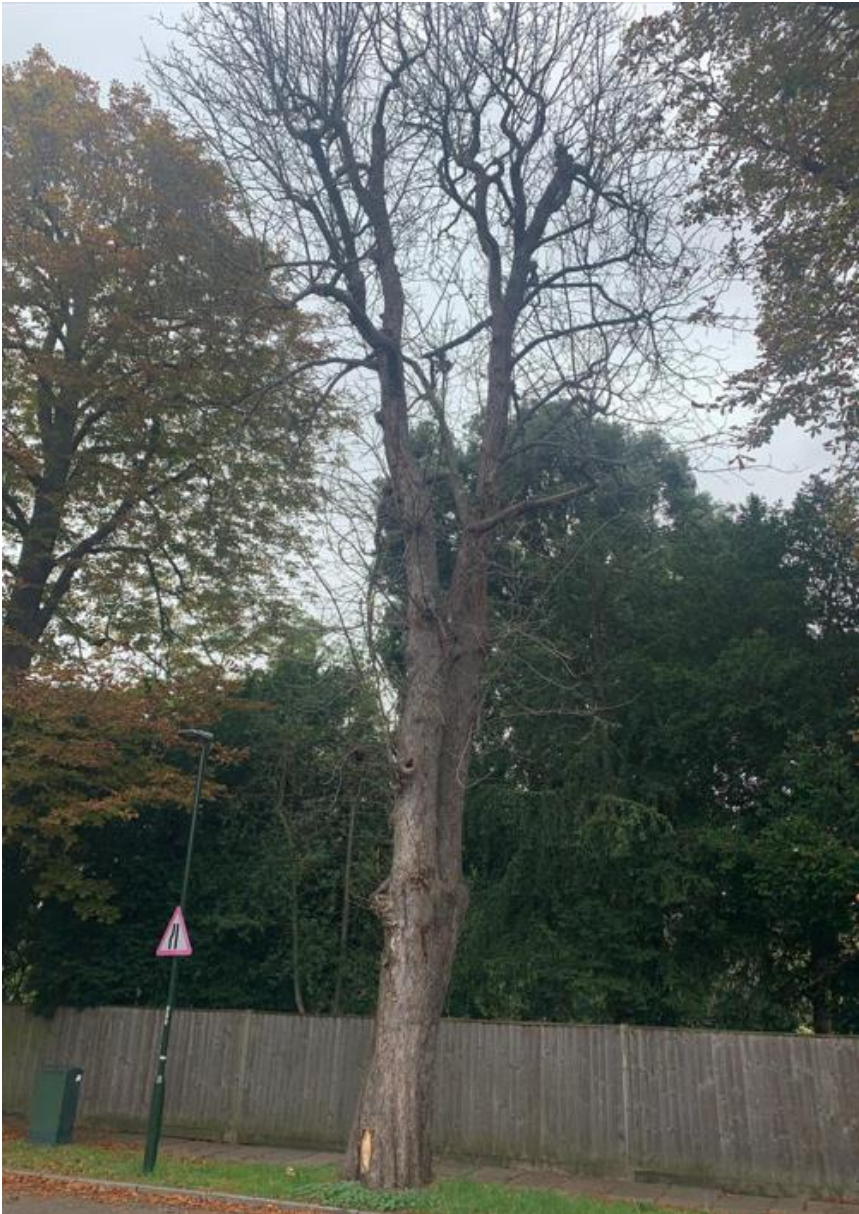
Image shows dead tree in street scene.