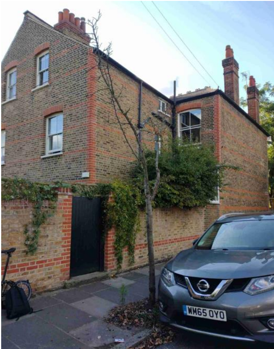
Image shows Dead tree in street scene.