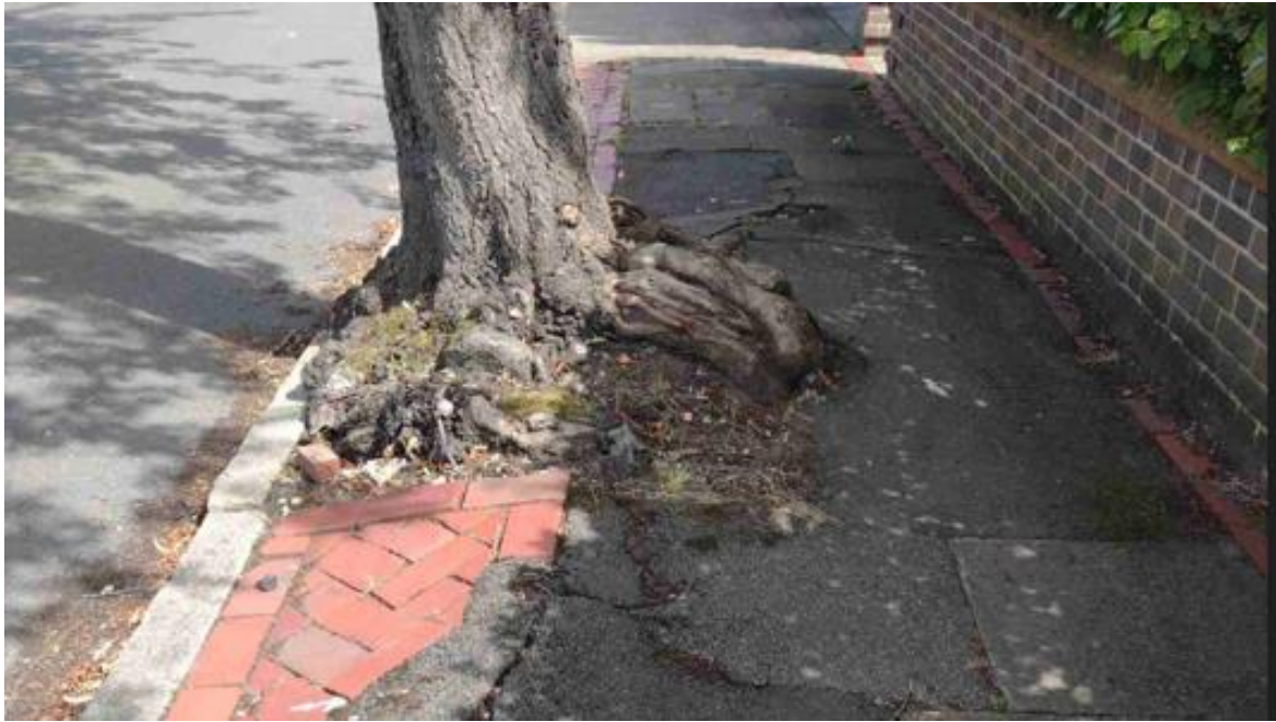
Image shows exposed damage roots at base of trunk obstructing pavement access.