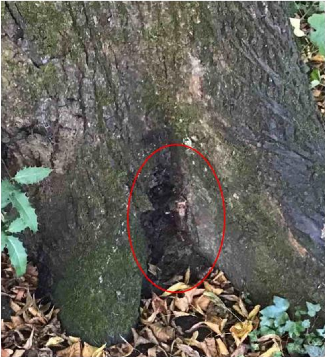
Image shows Kretzschmaria deusta pathogens at the base of trunk circled.