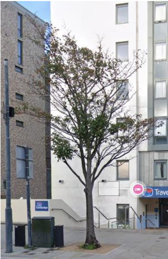
Images show tree in street scene