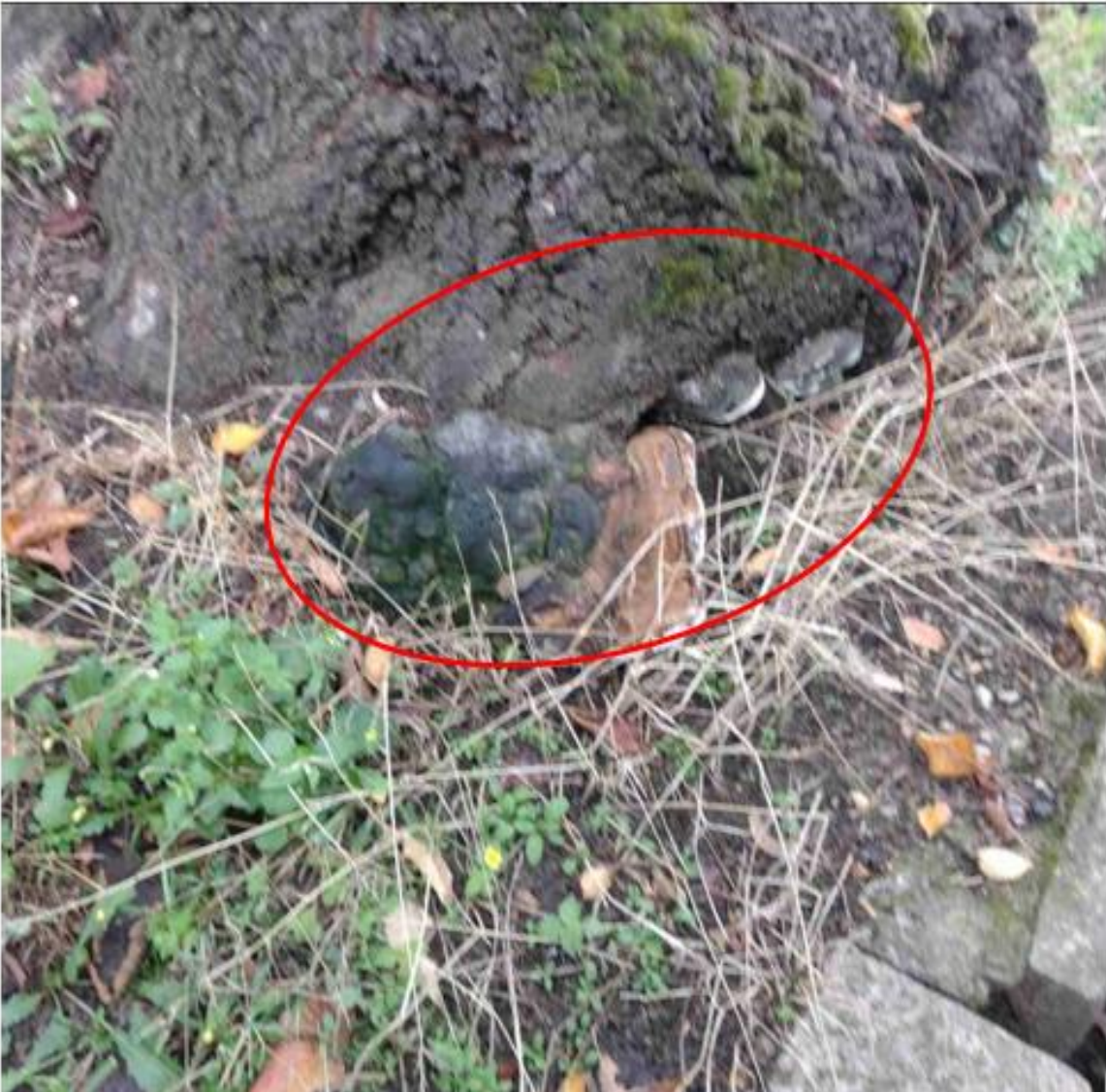
Image shows base of trunk with fruiting bodies circled.