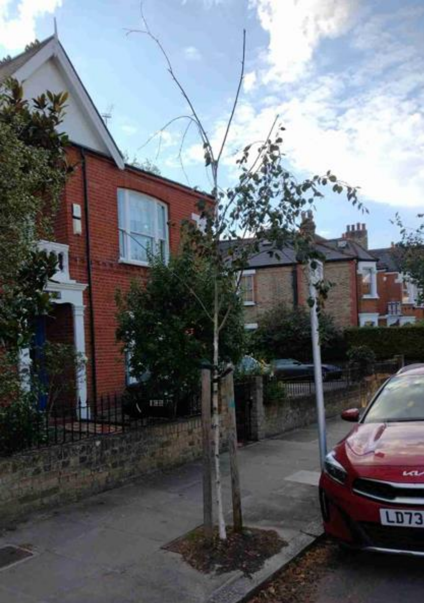
Image shows moribund tree in street scene.