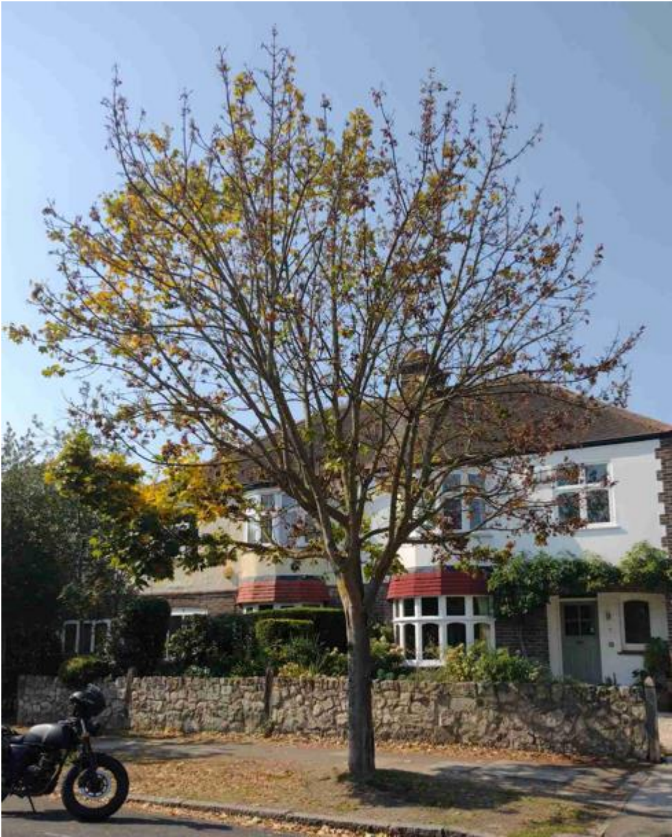
Image shows moribund tree in street scene.