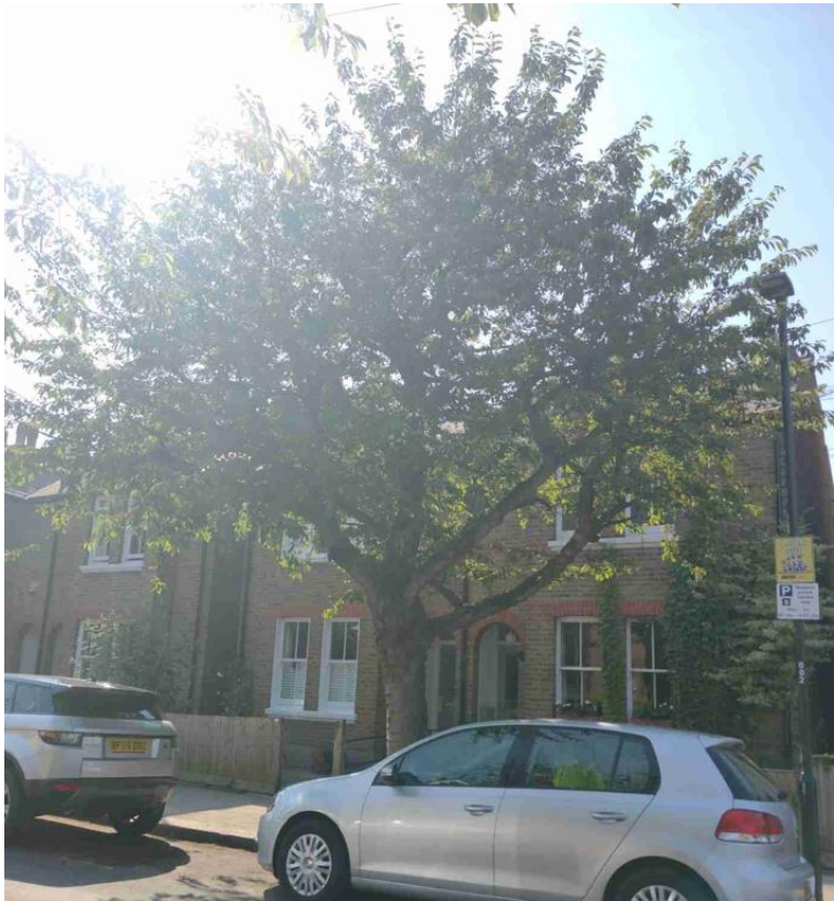
Image shows tree in street scene.