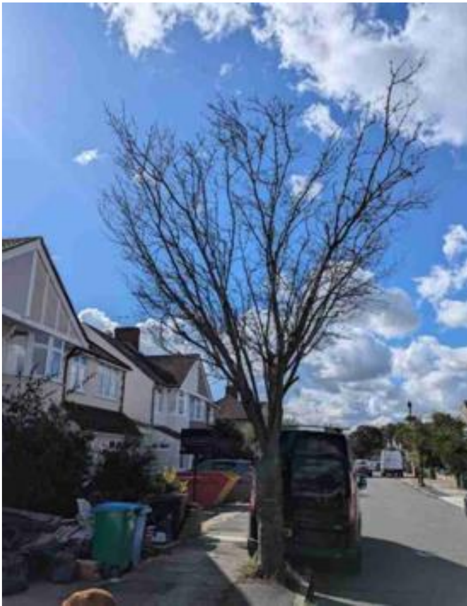
Image shows dead tree is street scene.