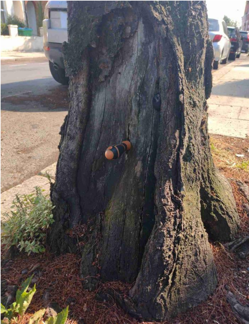
Image shows bark wounding at base of trunk.