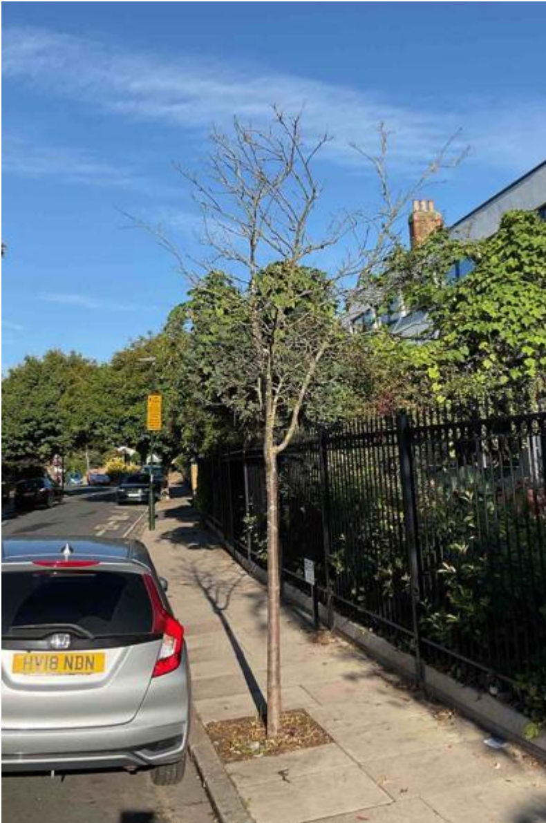
Image shows dead tree in street scene.