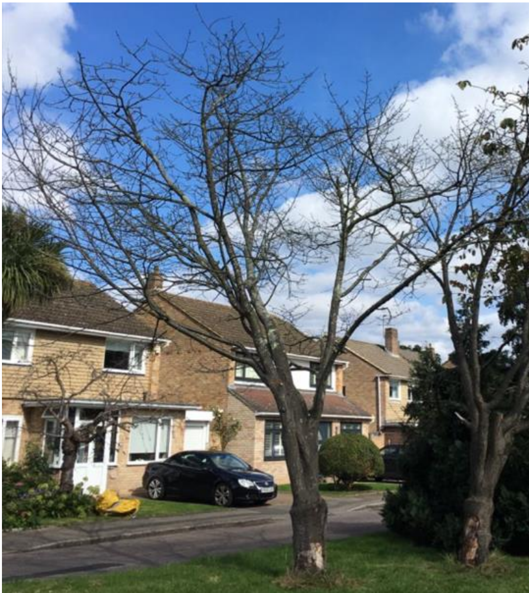
Image shows dead tree in street scene.