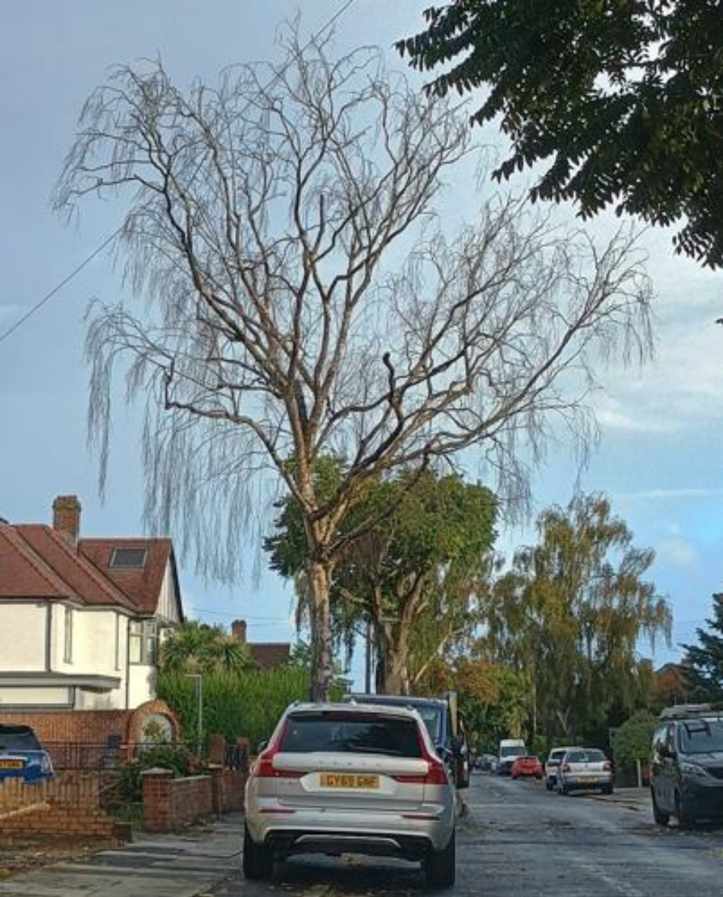
Images shows dead tree in street scene.