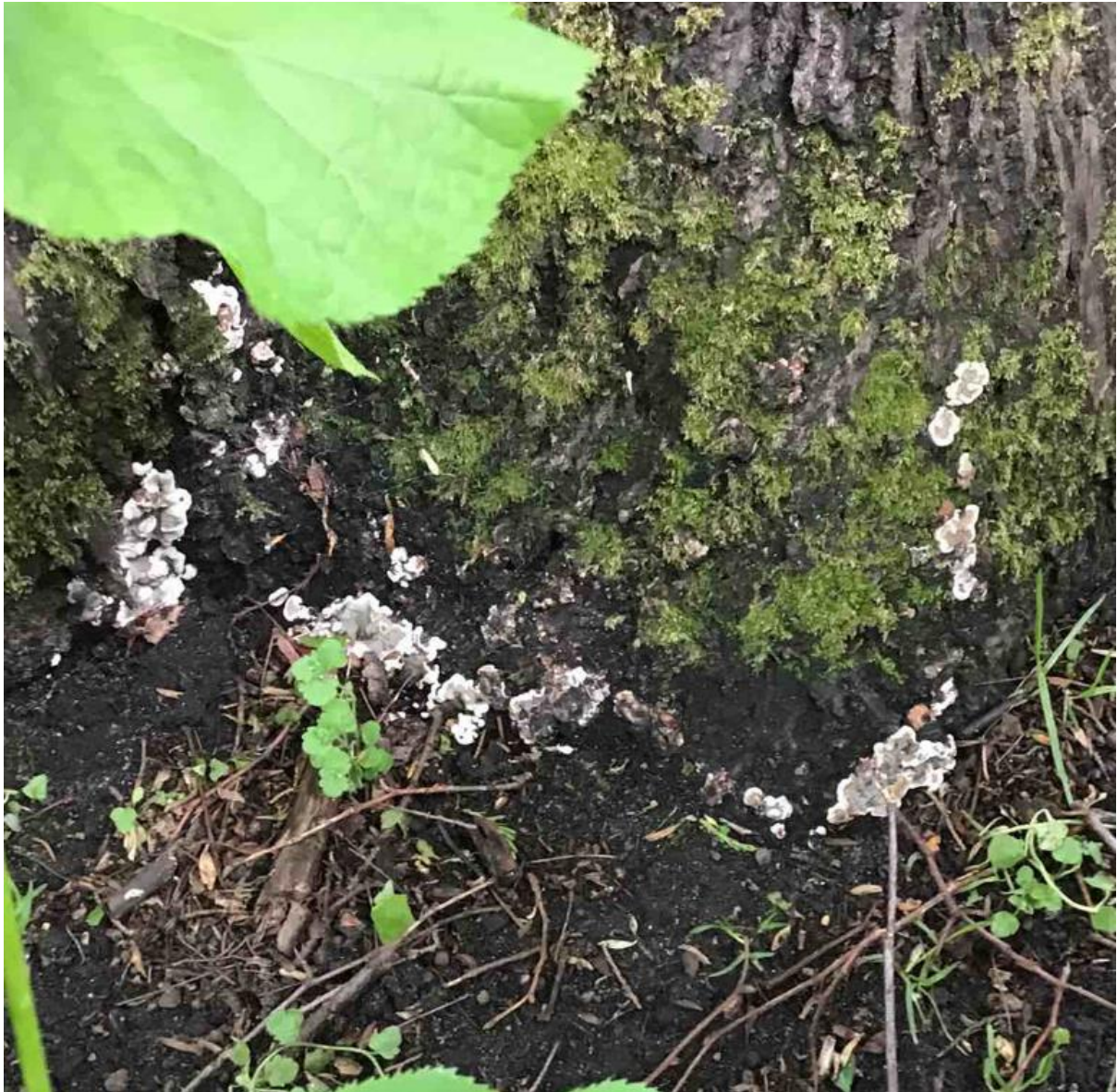
Image shows Kretzschmaria deusta pathogens at the base of trunk.