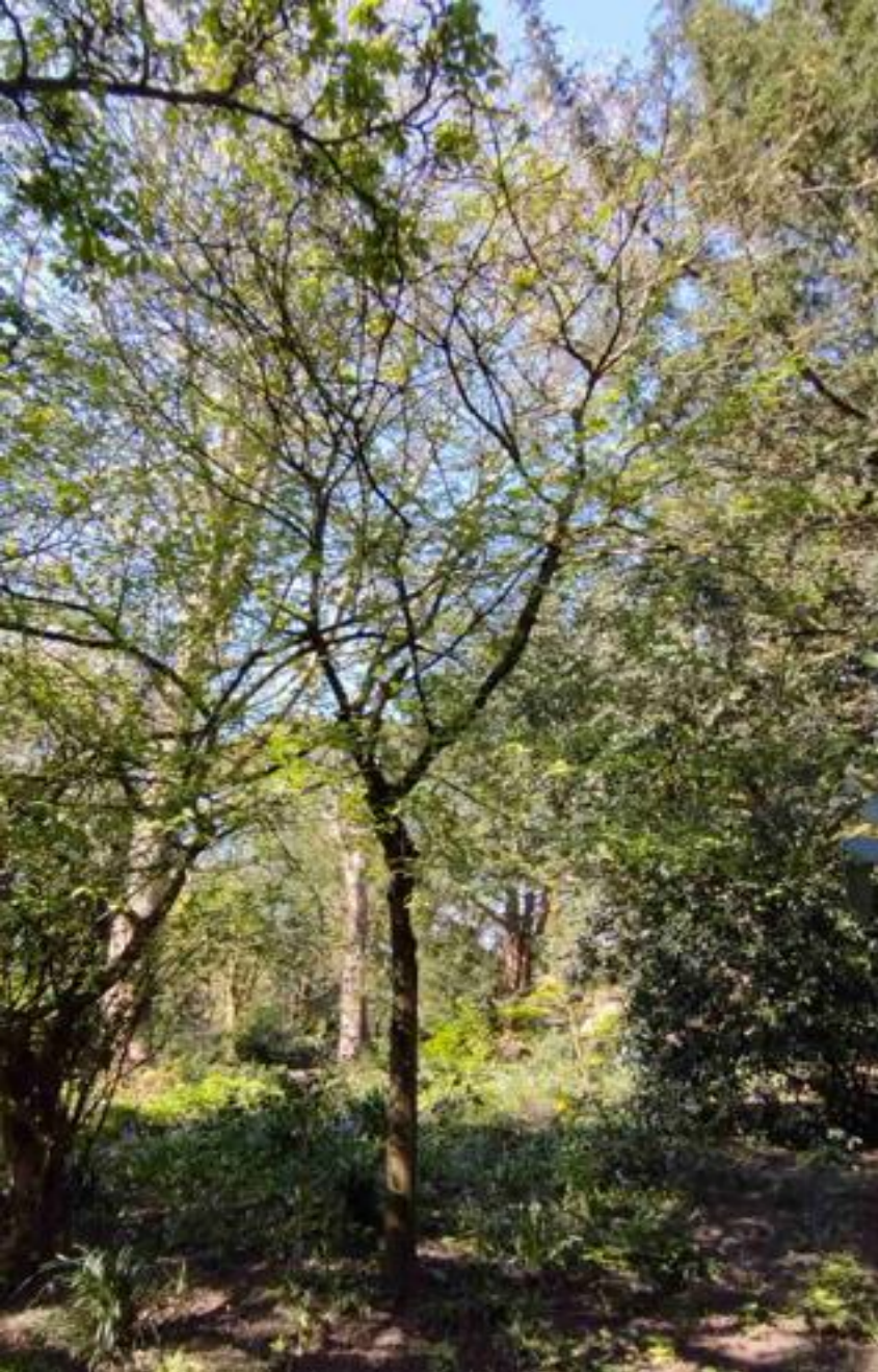
Image shows dead tree in park scene