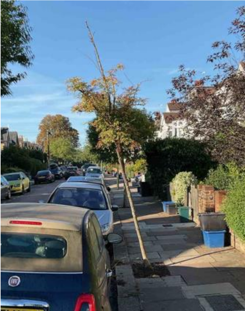
Image shows tree in street scene.