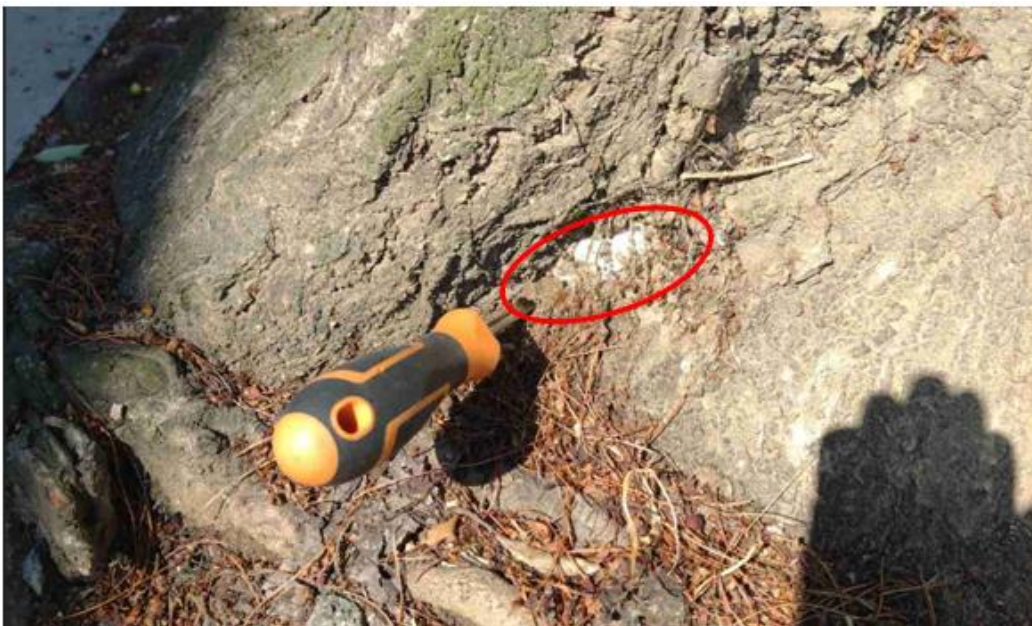
Image shows fungal fruiting body circled with prob showing decay in trunk.