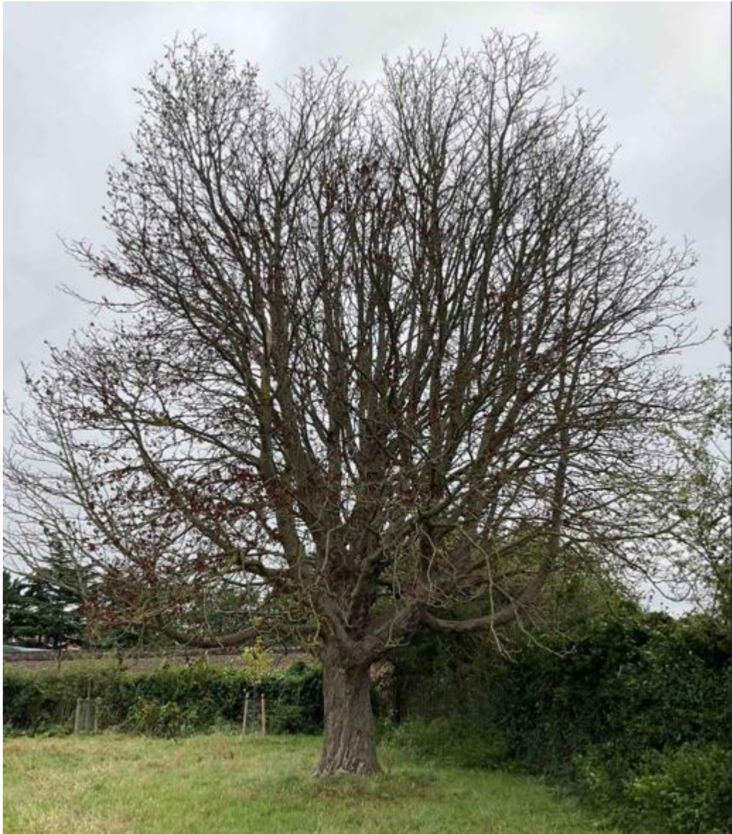
Image shows dead tree in park scene