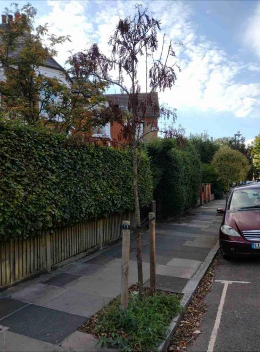
Image shows moribund tree in street scene.