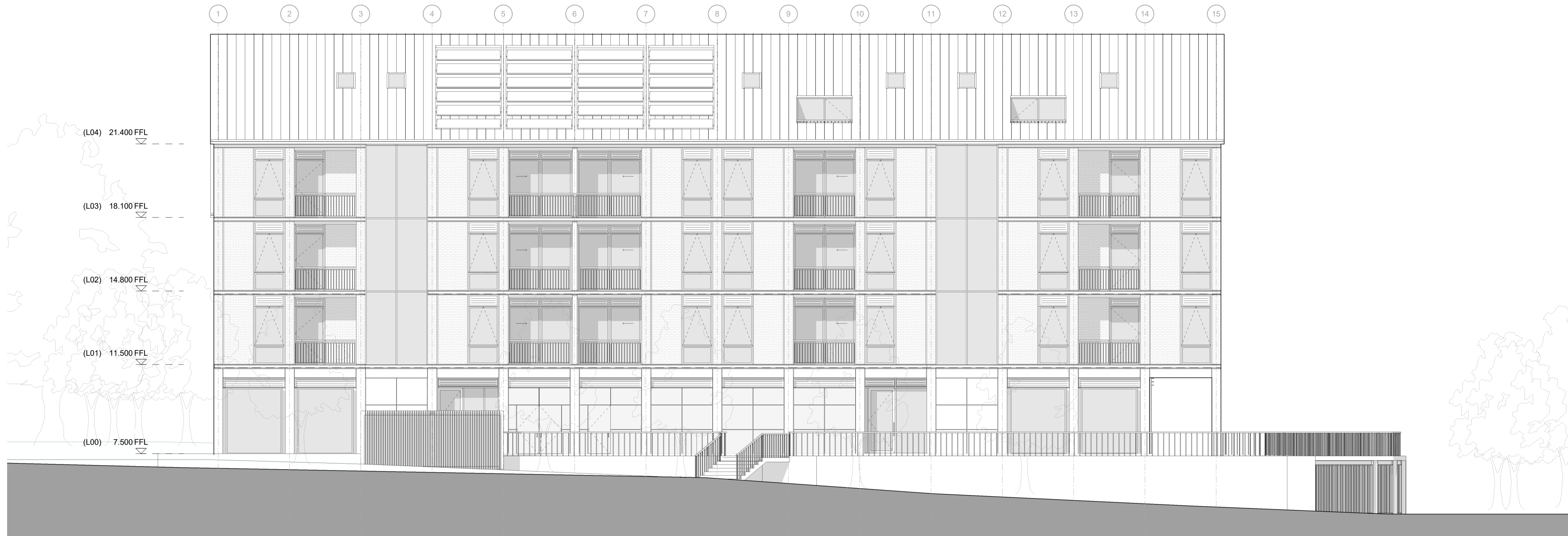
1 Wharf Lane - Wharf Lane Elevation 2651 1:100