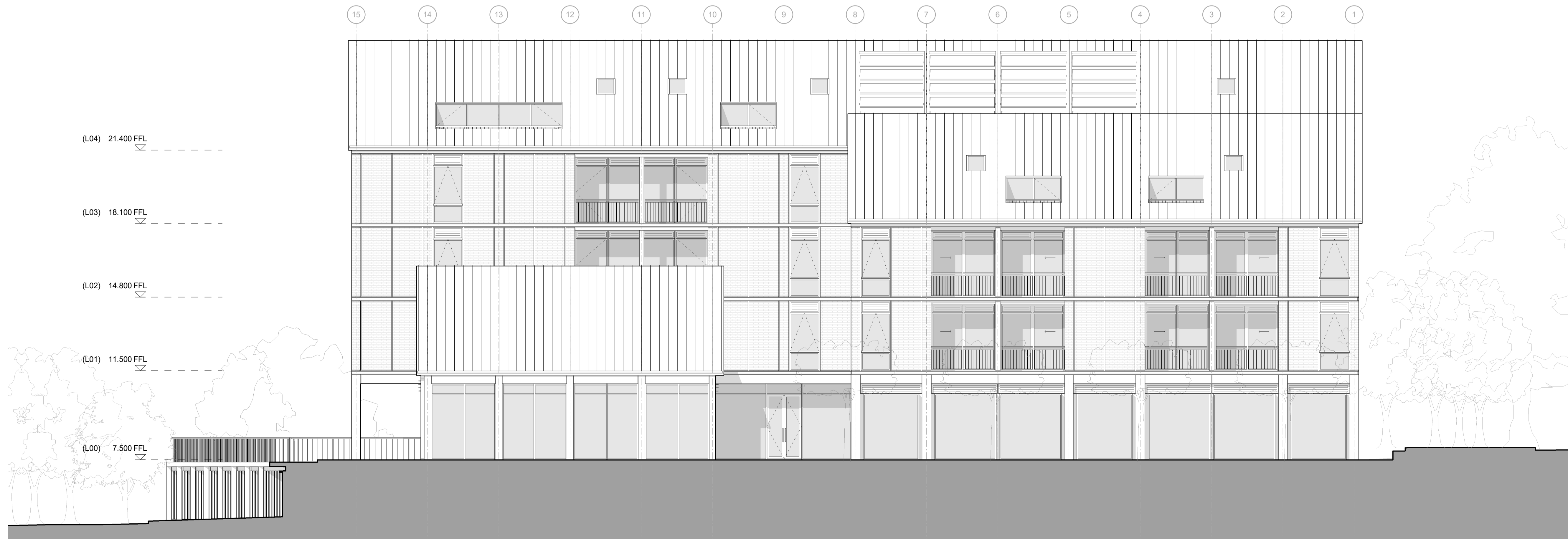
2 Wharf Lane - Garden Elevation 2651 1:100