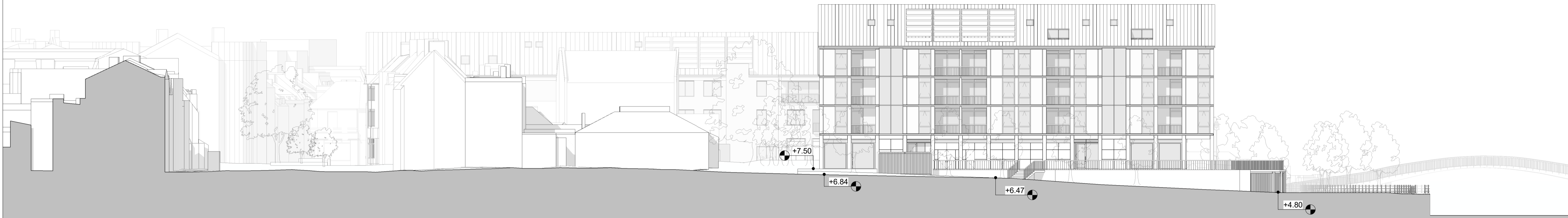
1 Proposed Site Section - Wharf Lane 2600 1:250