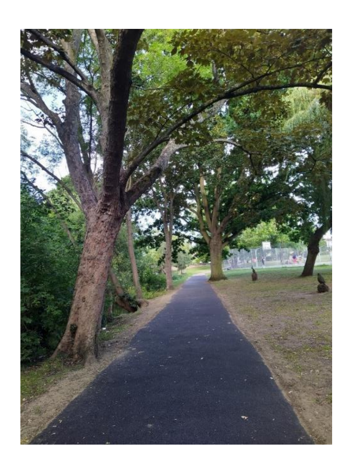
There are gentle slopes on paths towards the river edge