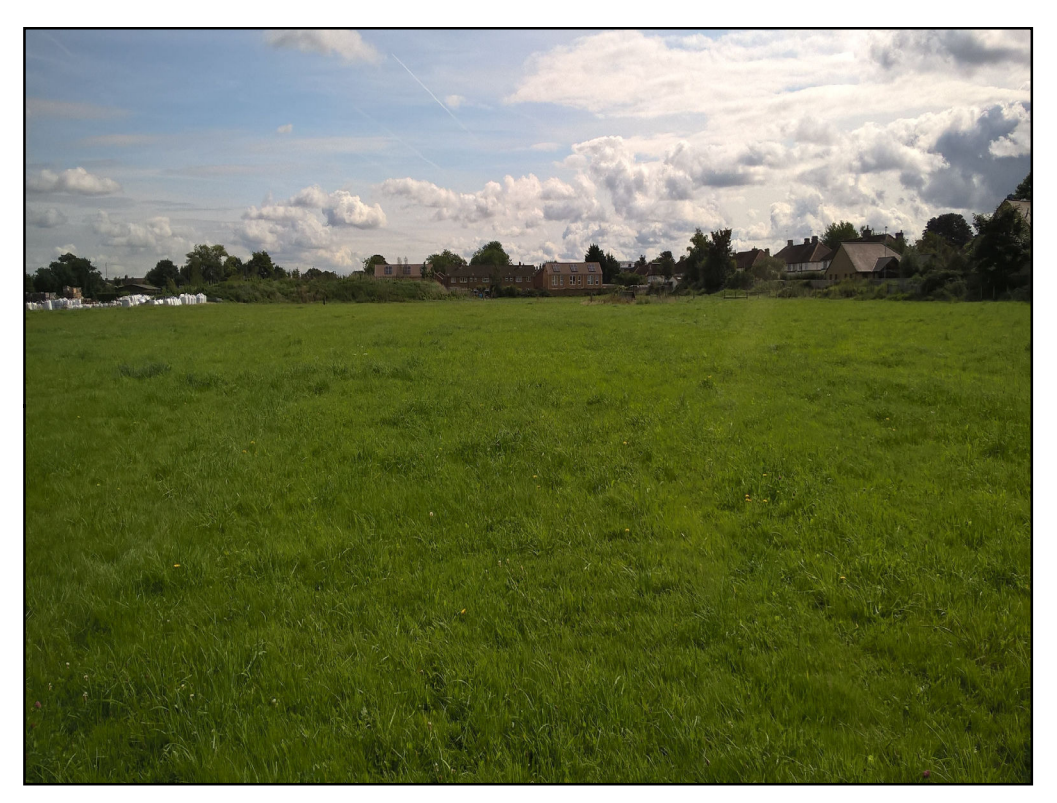
Photograph 2: Stand 2 MG7 Lolio-Plantaginion community, sub-community e.