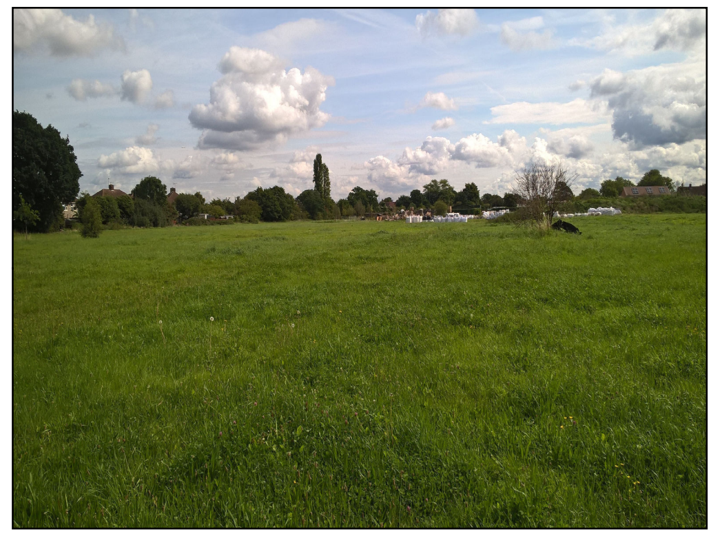
Photograph 1: Stand 1 OV23 Lolium perenne- Dactylis glomerata community, sub community d.