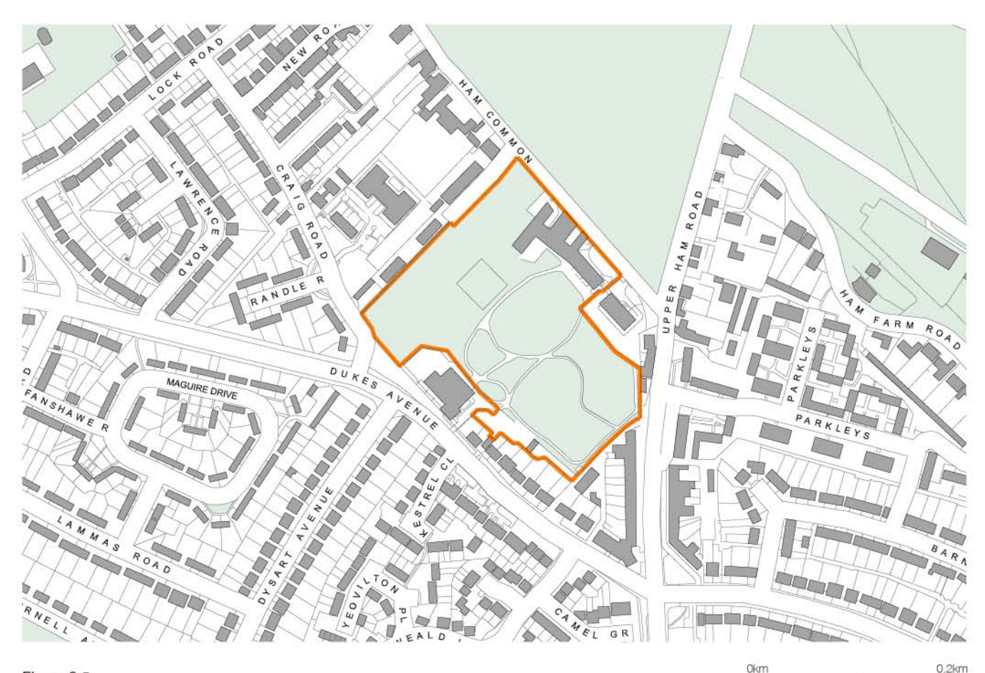
Figure 9.5: Cassel Hospital - Site Plan