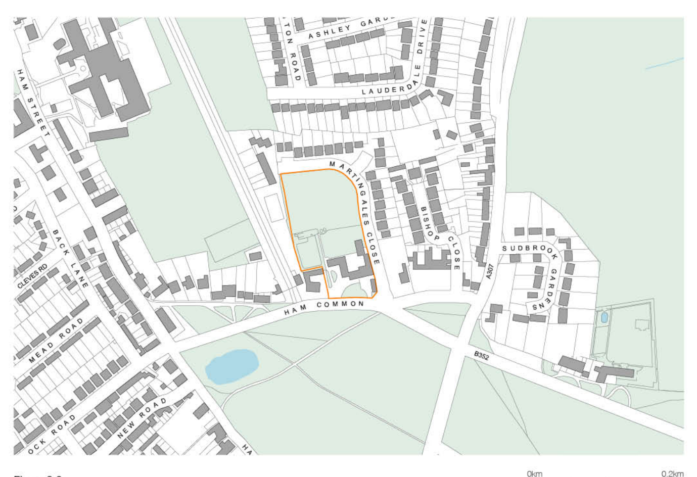
Figure 9.6: St. Michael's Convent- Site Plan