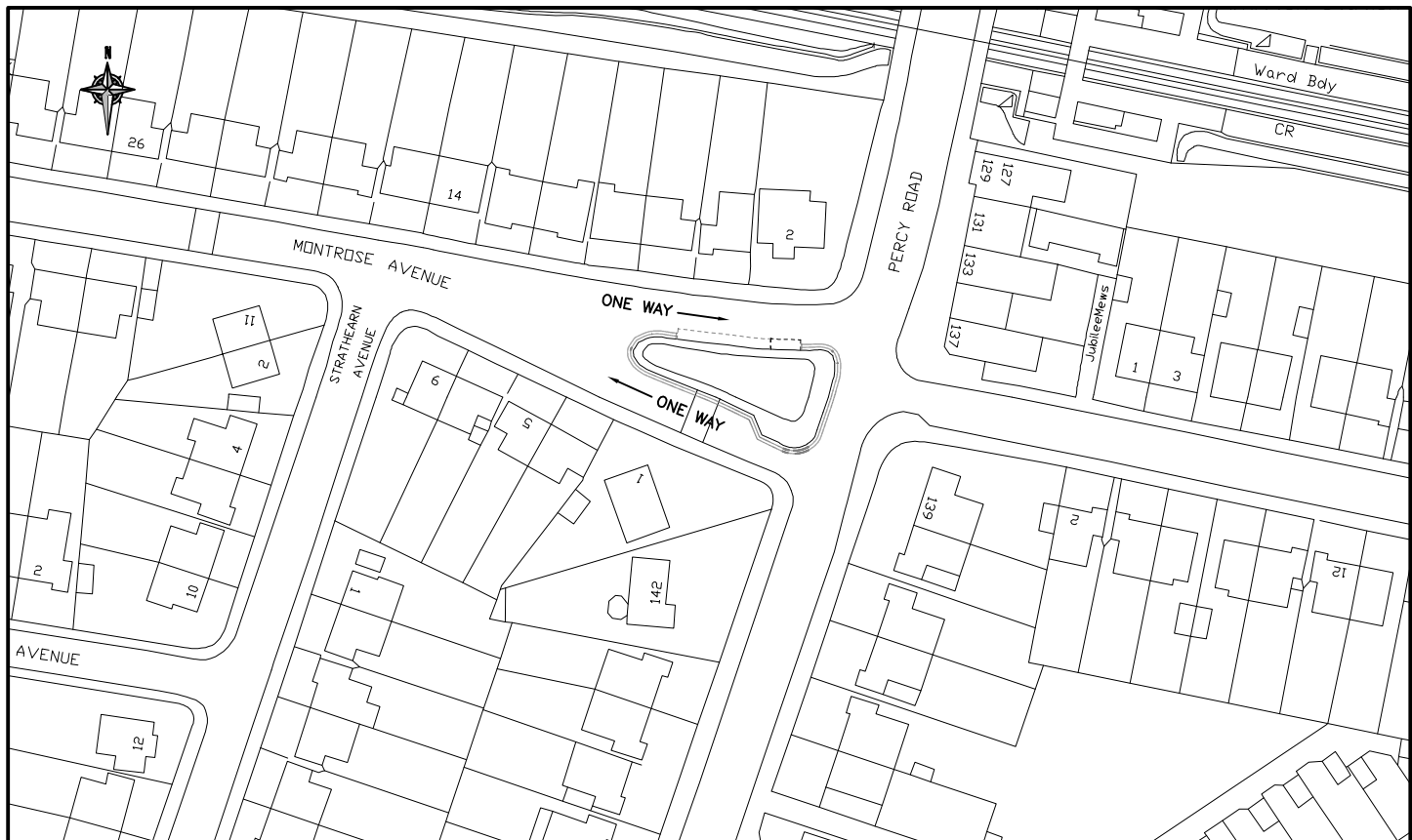
LOCATION PLAN—SCALE 1:1250