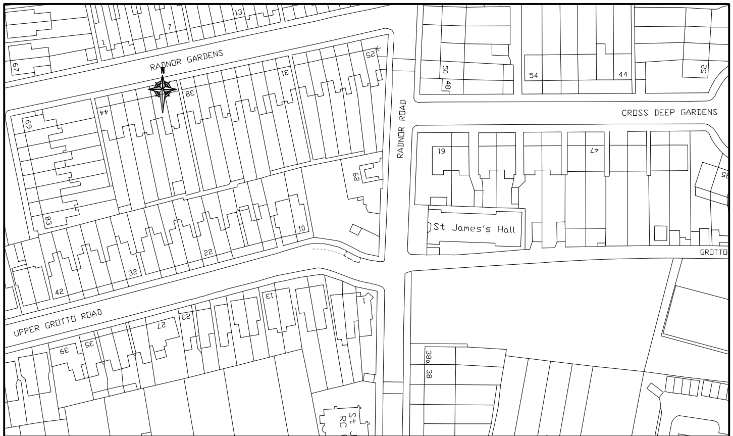
LOCATION PLAN - SCALE 1:1250