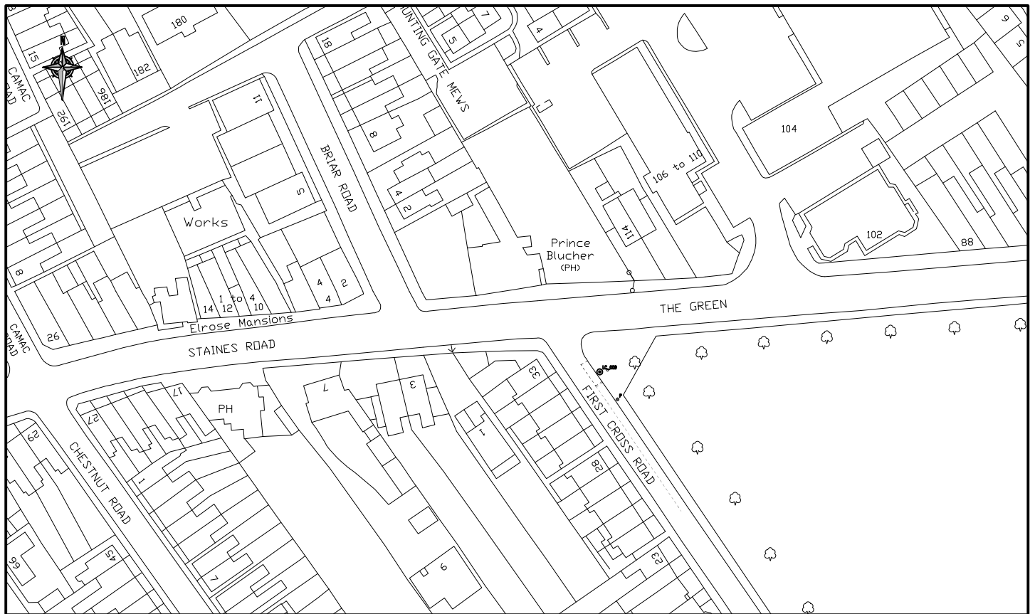
LOCATION PLAN - SCALE 1:1250