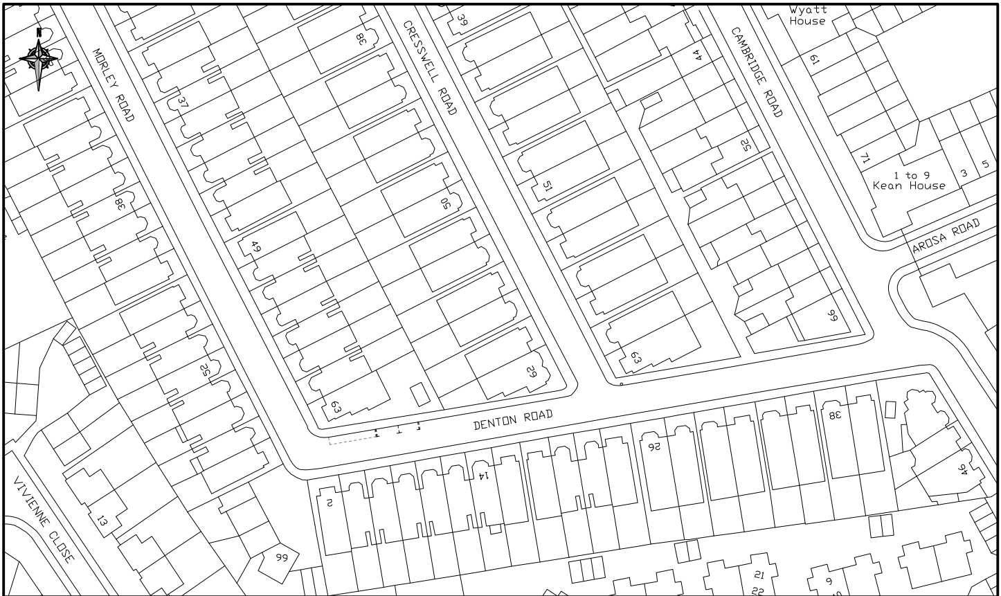
LOCATION PLAN - SCALE 1:1250