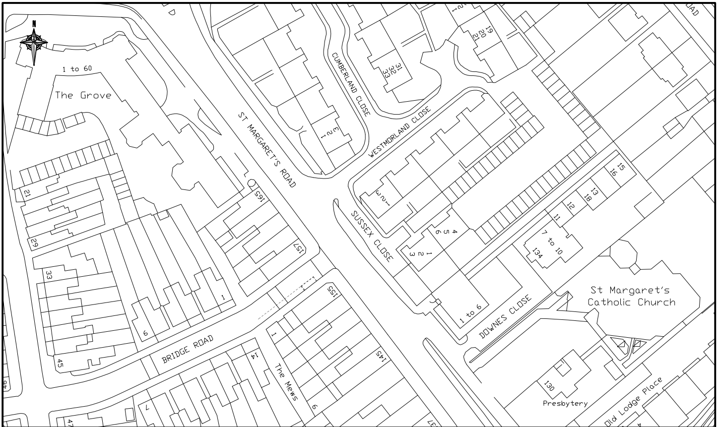
LOCATION PLAN—SCALE 1:1250