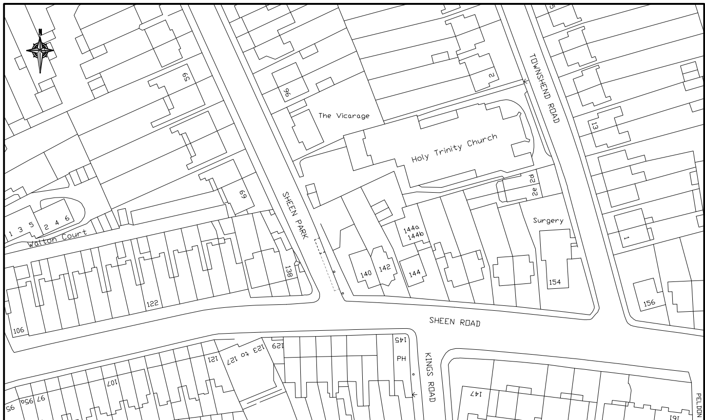
LOCATION PLAN—SCALE 1:1250