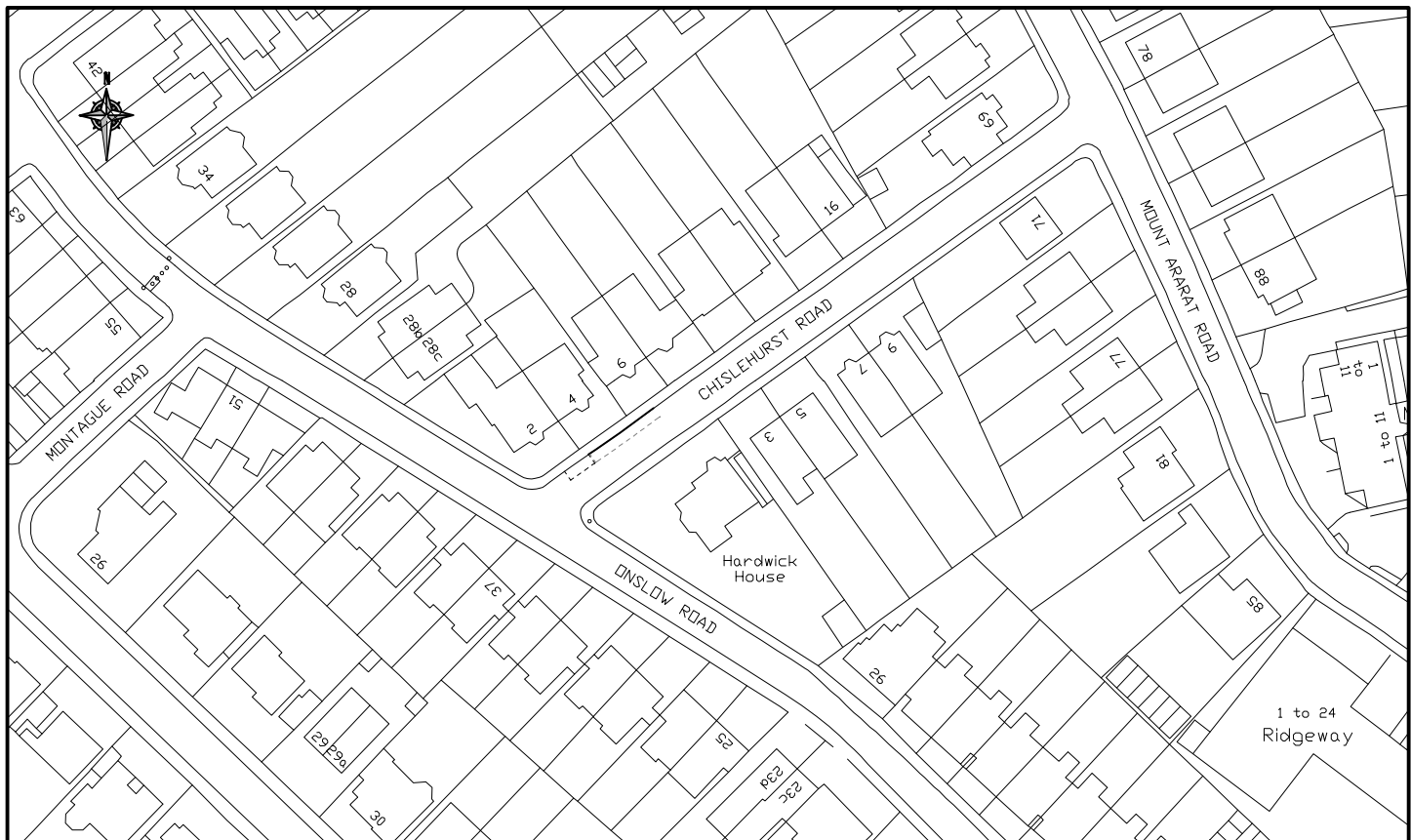
LOCATION PLAN—SCALE 1:1250