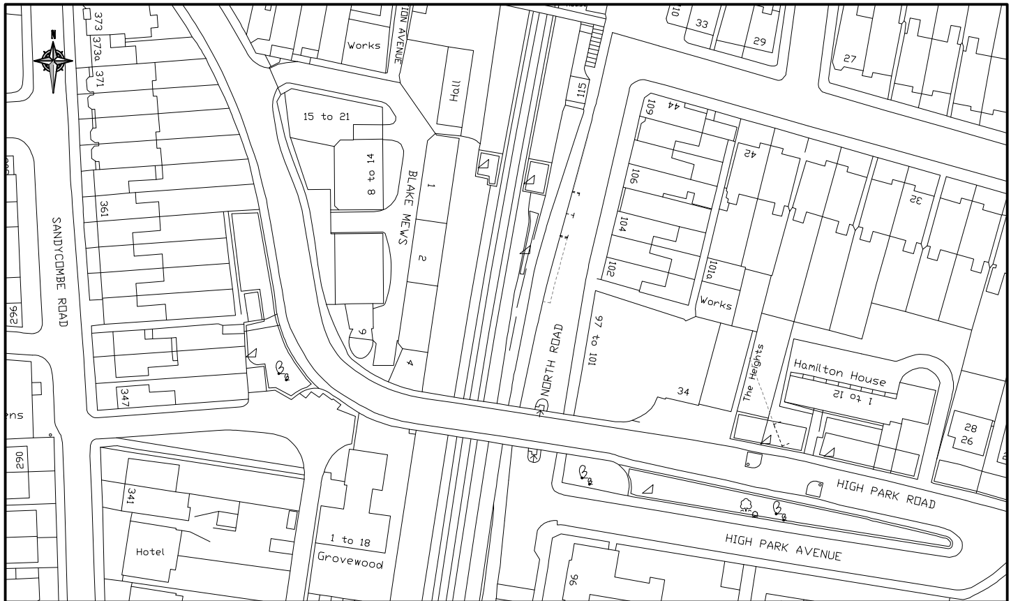
LOCATION PLAN—SCALE 1:1250