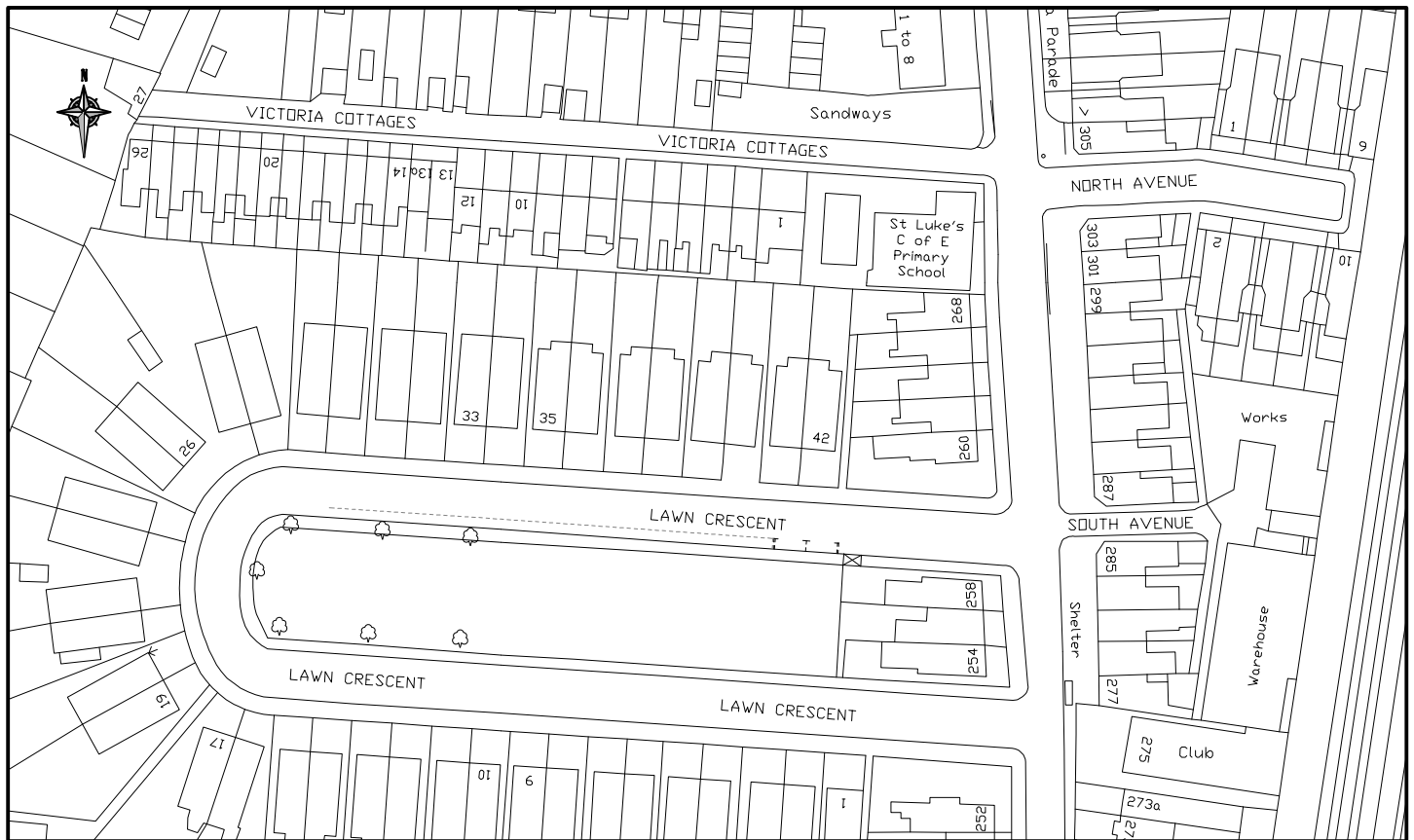
LOCATION PLAN—SCALE 1:1250