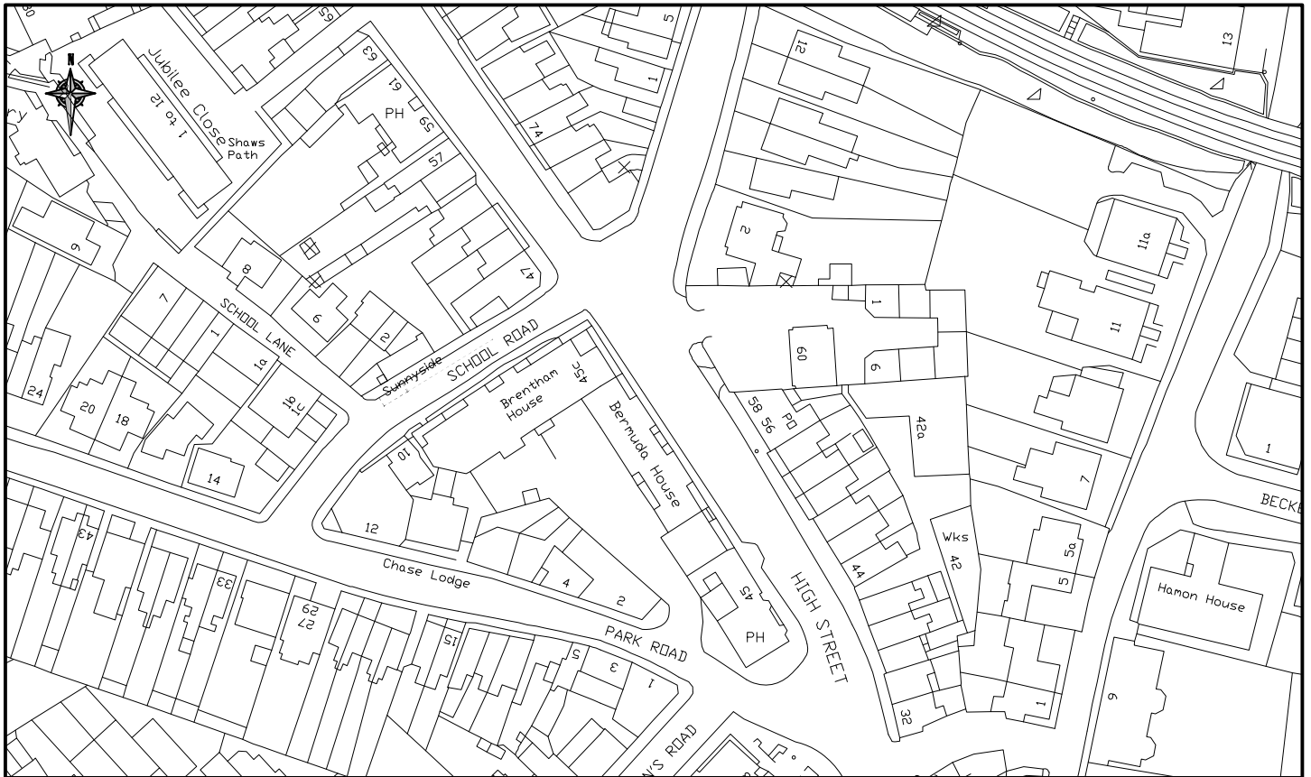
LOCATION PLAN - SCALE 1:1250