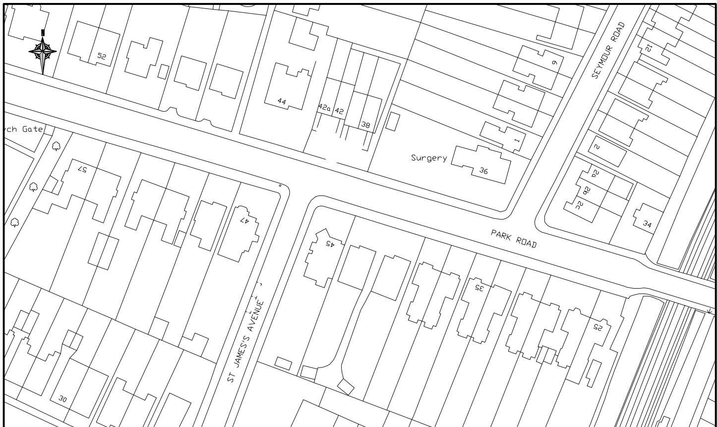
LOCATION PLAN—SCALE 1:1250