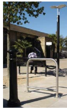
Quality materials and finish