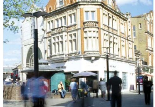
Modern with traditional