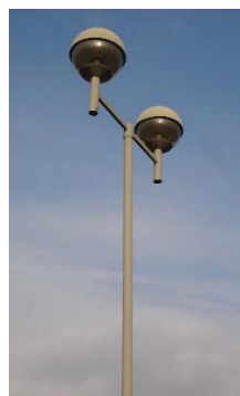
Light olive green