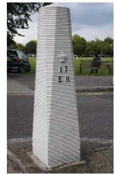
Reinforce local area distinctiveness