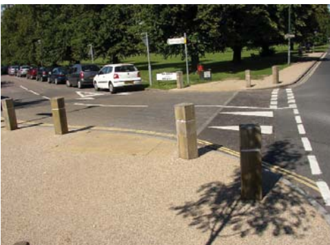
Designs for sensitive areas