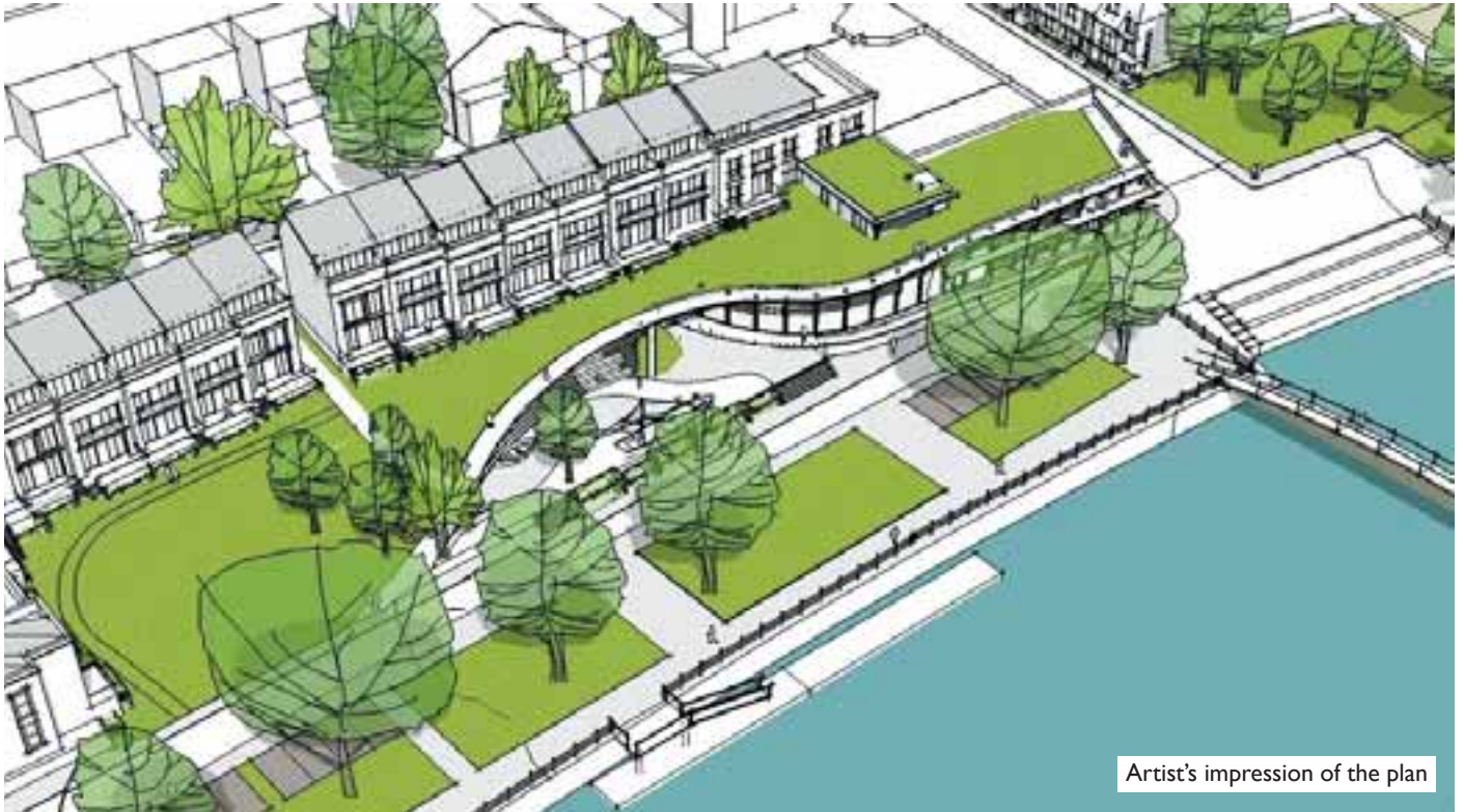
Artist's impression of the plan