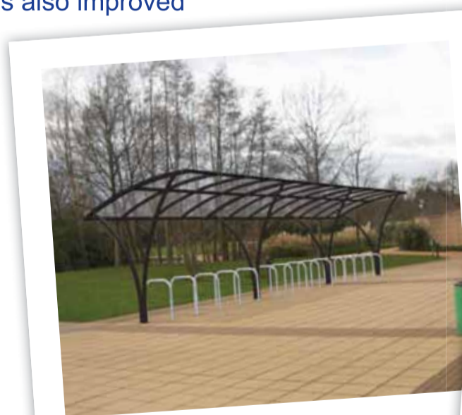
New Cycle Parking at The National Archives