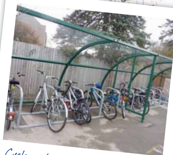
Cycle parking at Sacred Heart RC Primary School, installed May 2010