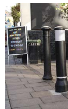
Plastic bollards tend to look cheap