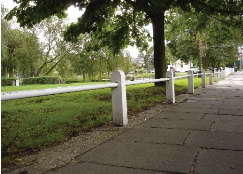
Timber post and metal rail