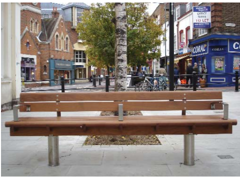
Scroll for town centres