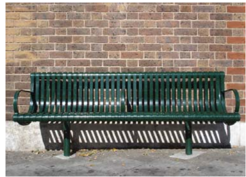
Festival for town centres