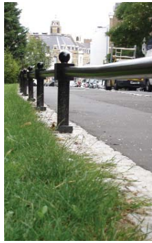
Low metal rail