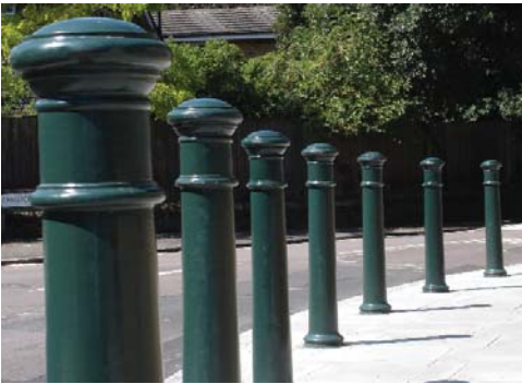
Too many bollards