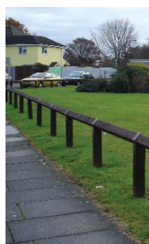
Timber post and rail