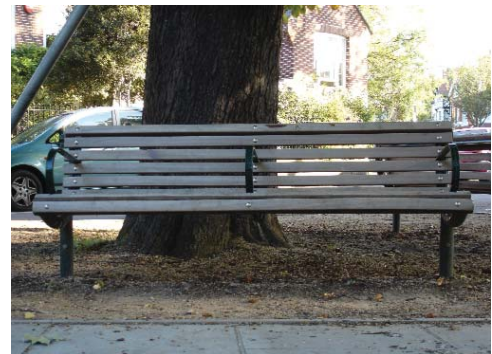
Festival with wood slats