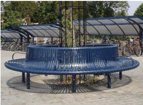
Festival for town centres