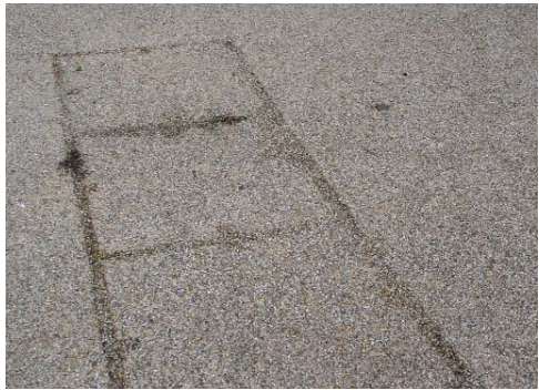
Recessed cover in sealed gravel