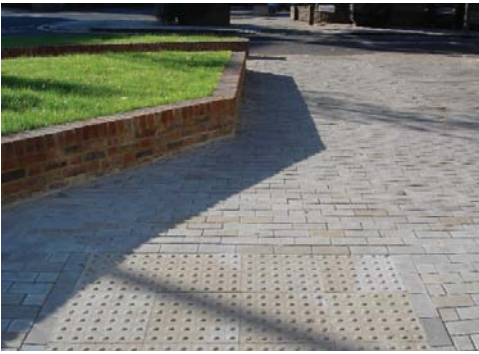
York stone tactile paving