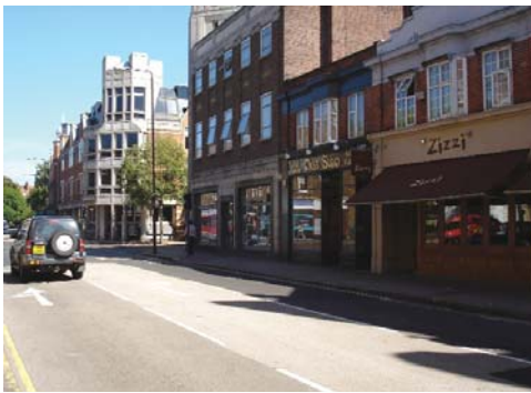
Light grey anti-skid surfacing