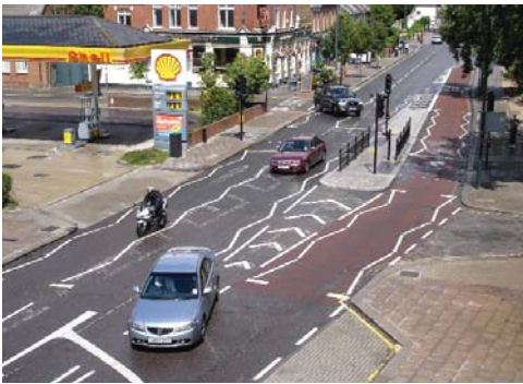
Over dominant hatch road markings