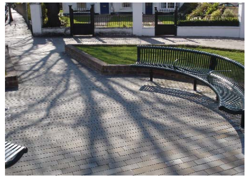
York stone setts