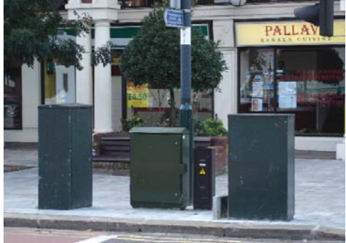
Obtrusive traffic control utility boxes