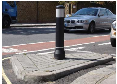
Build out in different material