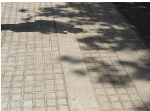
Recent granite crossover