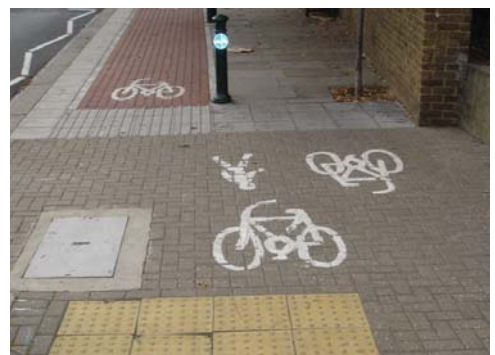
Too many materials