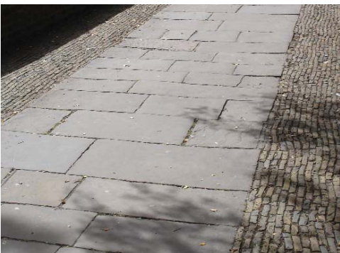
Historic York stone and brick paving