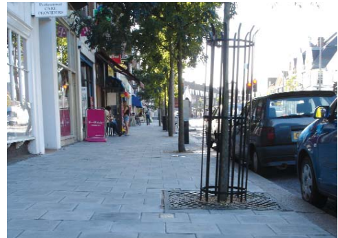
Small element paving slabs

Bredon gravel – This surfacing provides a less urban character and is particularly appropriate in open areas. The material has been used for paths across Richmond Green. It is also used as a surfacing material for tree pits. Maintenance implications needs to be born in mind.