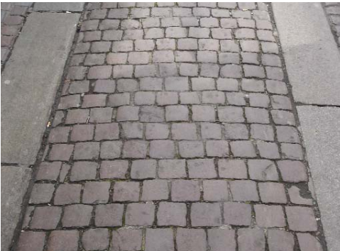
Historic granite paving

Historic paving elements should always be retained within schemes where possible. Examples are areas of granite setts/kerbs and York stone paving/kerbs.