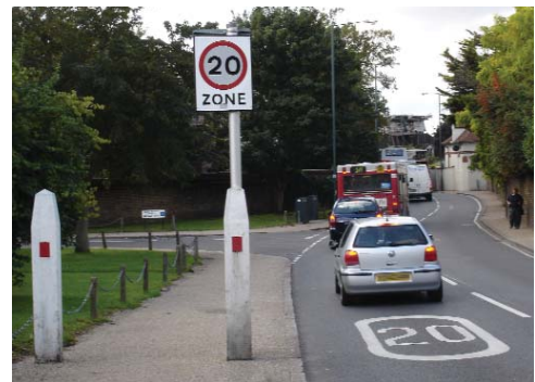
20 mph zone in Ham and Petersham

Bus lanes – Coloured bus lanes should be in stone mastic asphalt (SMA) to avoid the surface wearing off and provide a softer colour contrast to other materials. There may be exceptional situations where a coloured finish should not be used.