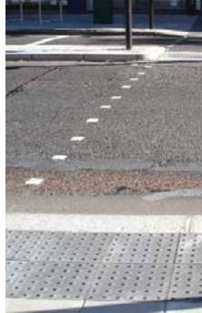
Grey tactile paving/Charcoal tactile paving