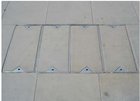
Neatly finished manhole cover

The possibility of locating electrical gear in a less obtrusive way is being investigated. Where this is not possible they should be sited as unobtrusively as possible, related to other items of street furniture if appropriate, and painted to match the surrounding colour of street furniture. Use only one box where possible to avoid clutter. Graffiti resistant paint should be considered. 'Artex' finishes are not to be used, but raised panels will reduce the risk of flyposting.