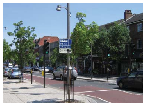
Bus lane in red SMA