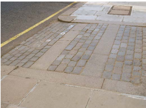
Traditional granite crossover