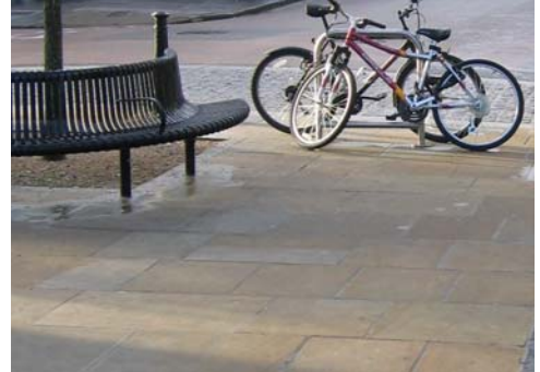
York stone paving