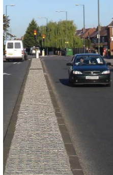
Traffic islands (before and after)