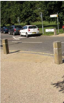
Buff tactile paving