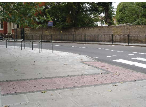
Avoid long tails on tactile paving