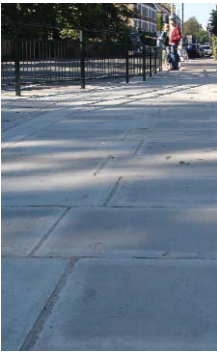
Traditional paving slabs (ASP)