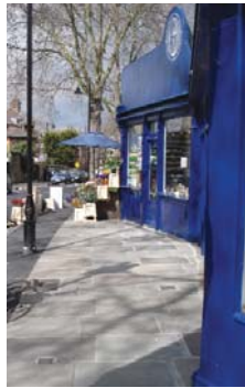
Reuse paving slabs