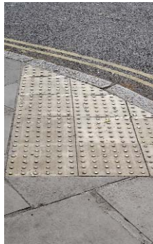
Avoid odd angles