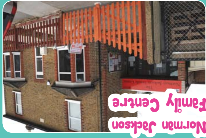
Norman Jackson Family Centre