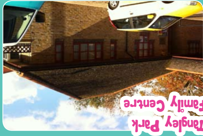
Tangle Park Family Centre