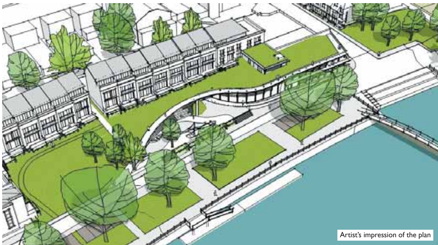
Artist's impression of the plan