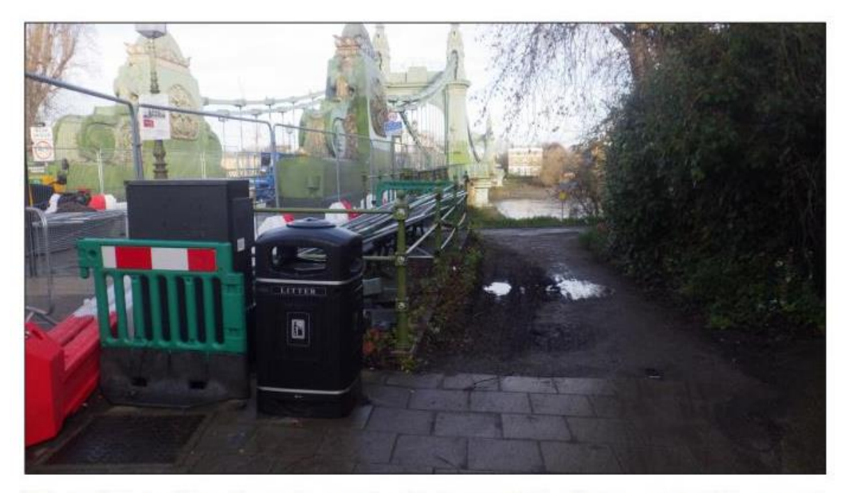
Plate 3: View of position of the southern abutment to temporary bridge (looking north) with Hammersmith Bridge in the background

The Temporary Bridge will land either side of the River Thames (River); into the London Borough of Hammersmith and Fulham (LBH&F) on the north bank, and the London Borough of Richmond upon Thames (LBRuT) on the south bank. By its very nature, the River is undeveloped, however, the southern landing area is partially hard surfaced: