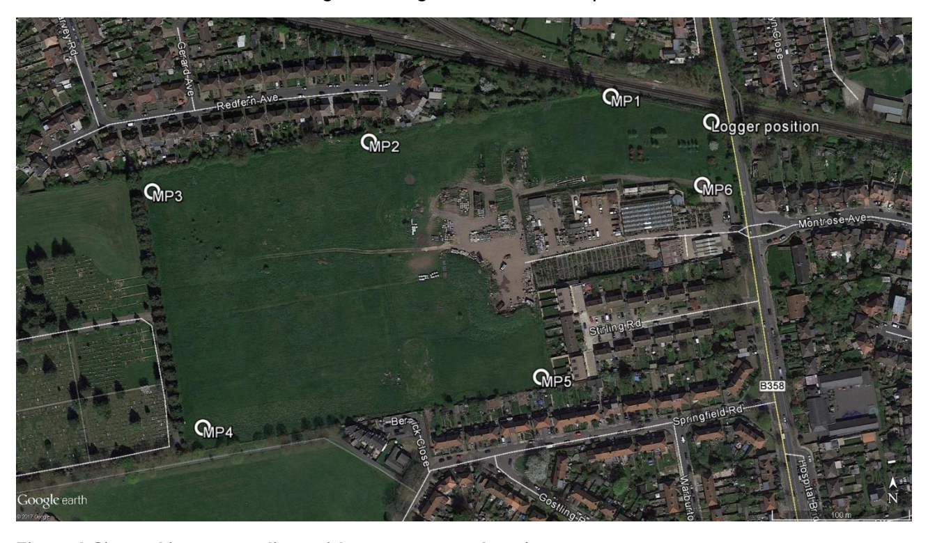
Figure 1 Site and its surroundings with measurement locations

The site location, with its surrounding area, along with measurement positions is shown below.