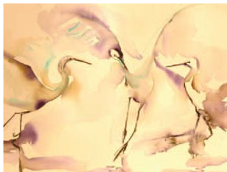
Egrets of the River Thames

BARNES MUSIC FESTIVAL London Wetlands: A Musical Aviary Tuesday 21 March, 7.30pm London Wetland Centre £15