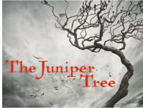
© 1985 Dunvagen Music Publishers Inc. Used by Permission.

Tickets via 020 8977 7558 or www.landmarkartscentre.org