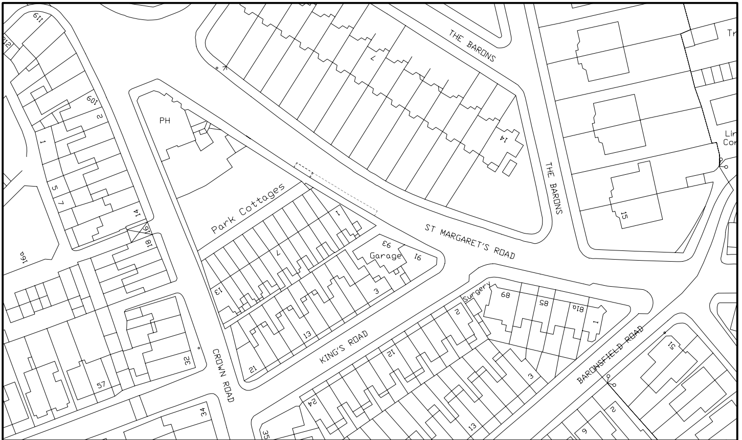
LOCATION PLAN - SCALE 1:1250