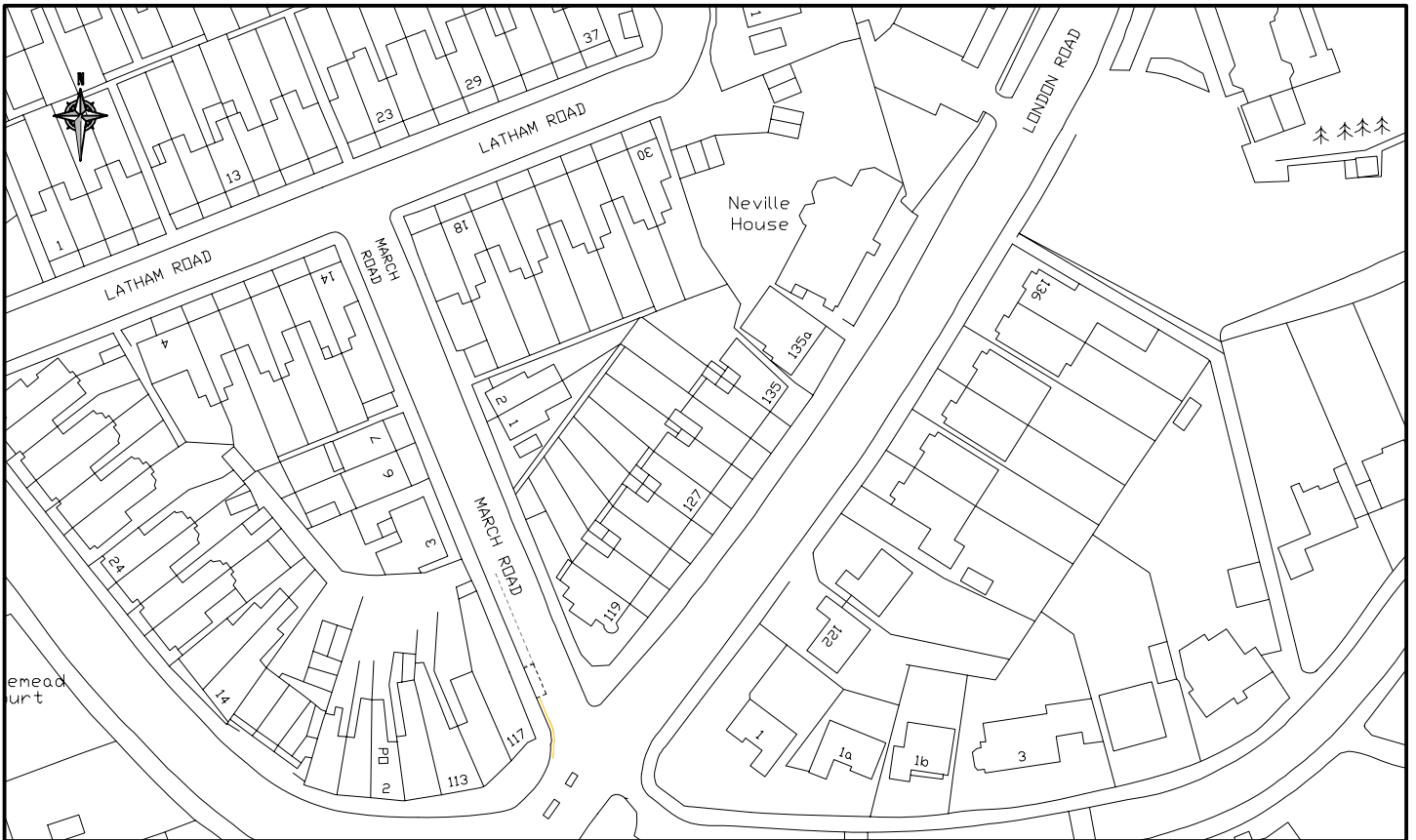
LOCATION PLAN-SCALE 1:1250