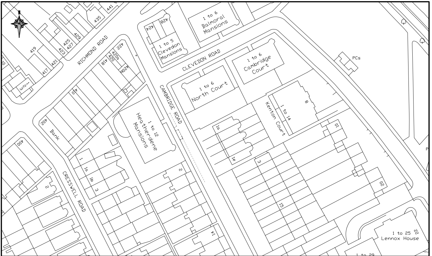
LOCATION PLAN-SCALE 1:1250