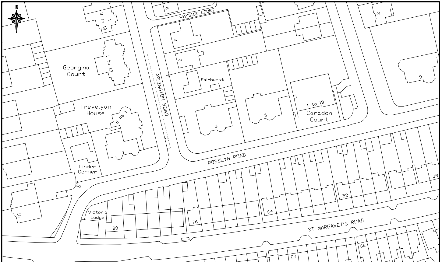
LOCATION PLAN-SCALE 1:1250