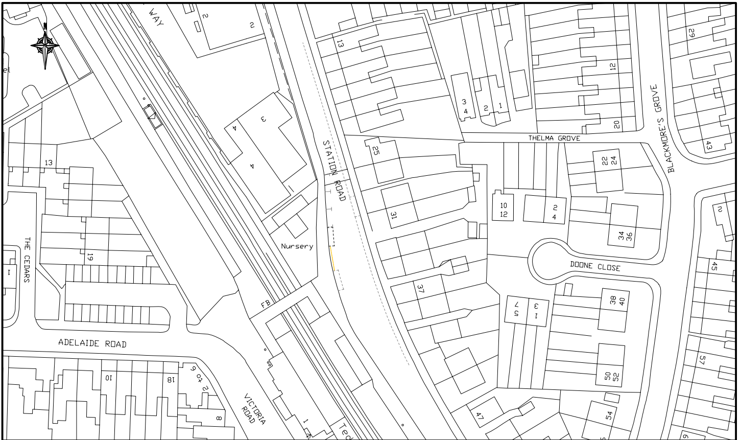
LOCATION PLAN—SCALE 1:1250