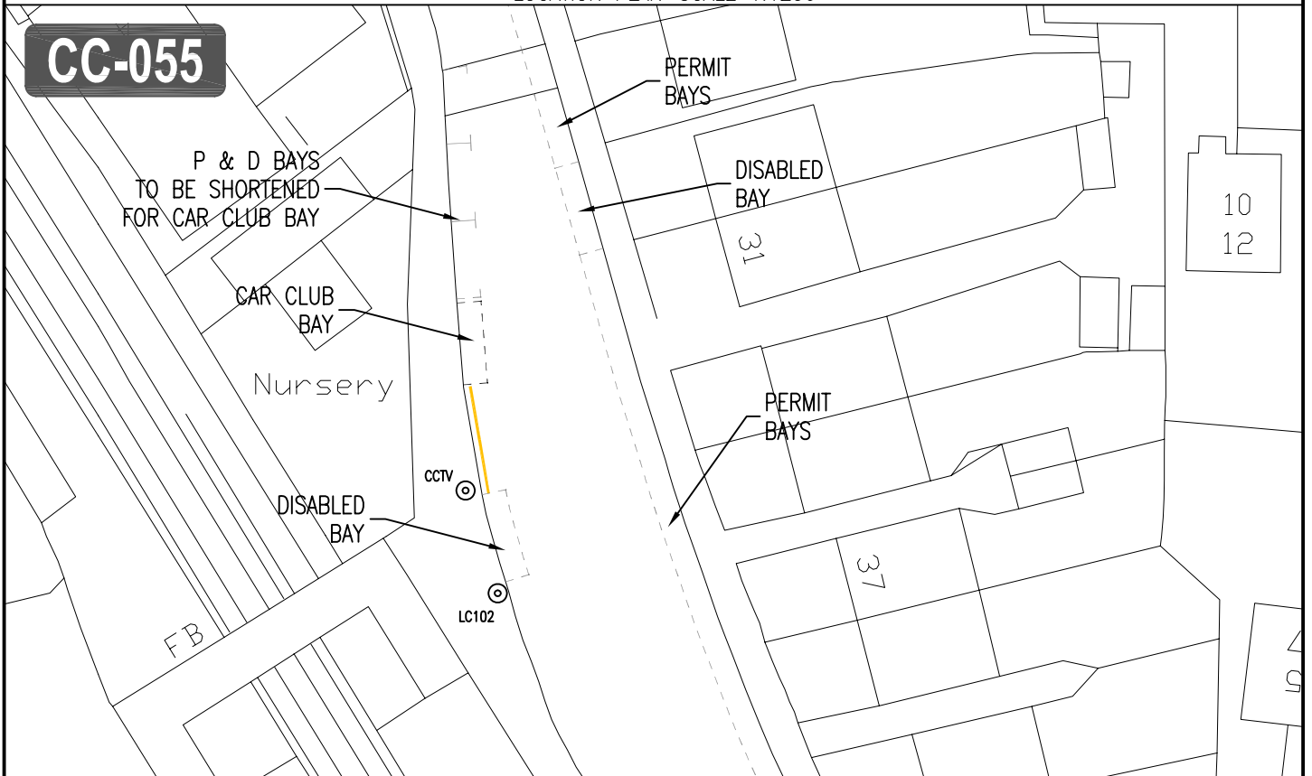
DETAIL PLAN – SCALE 1:500