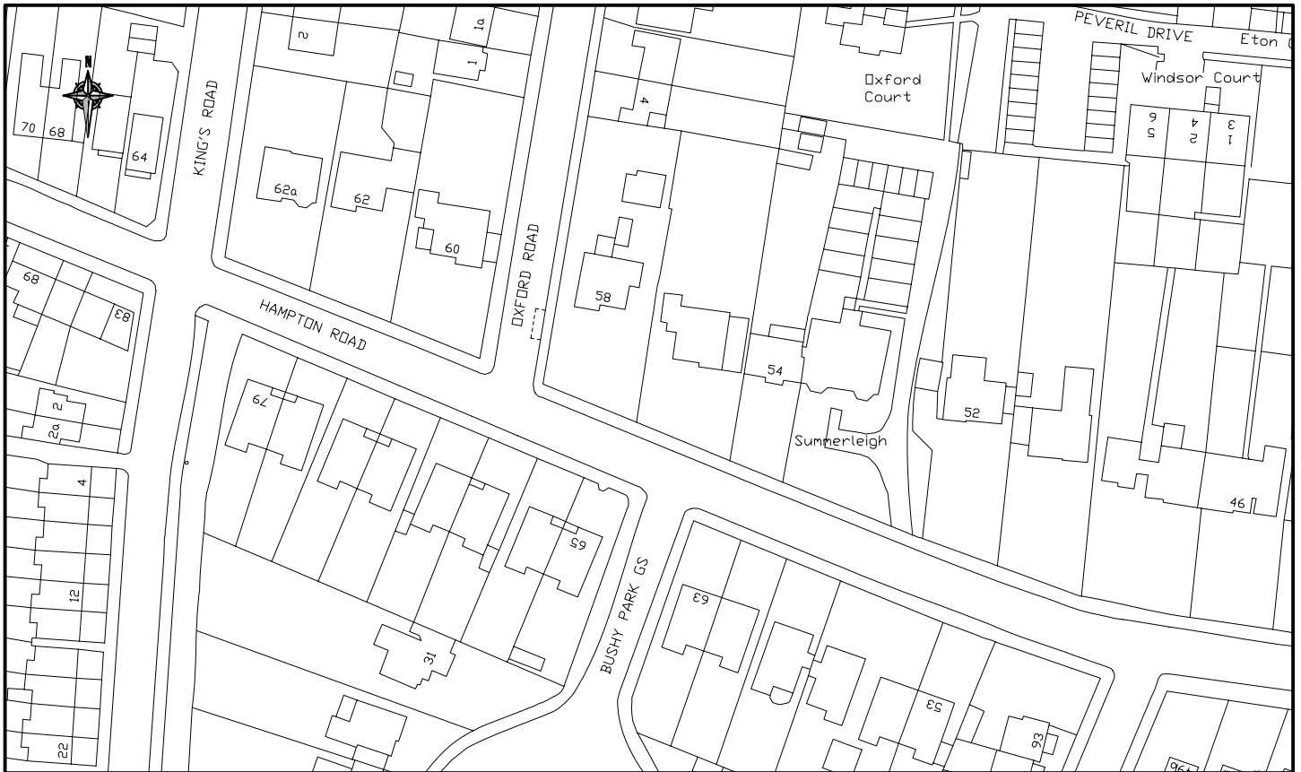
LOCATION PLAN-SCALE 1:1250