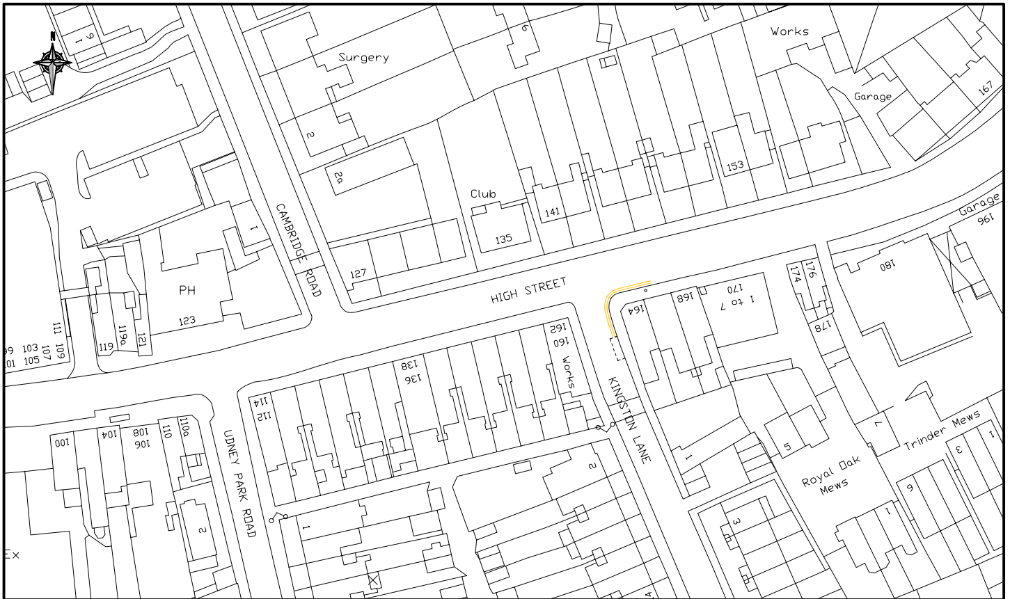
LOCATION PLAN - SCALE 1:1250