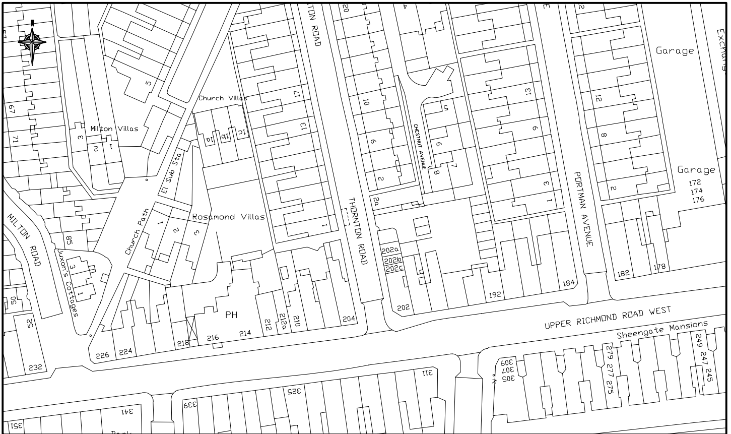
LOCATION PLAN-SCALE 1:1250