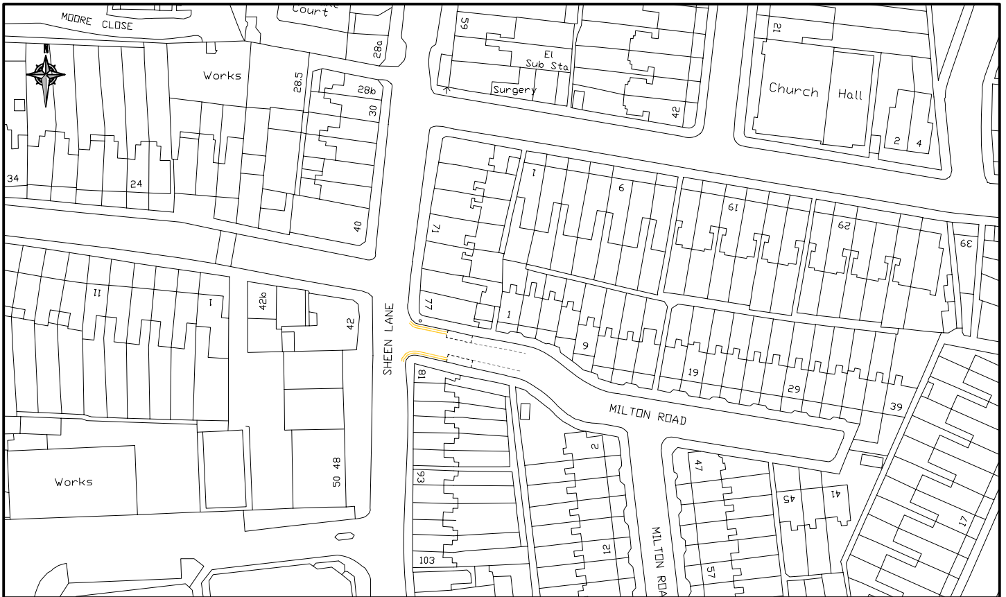
LOCATION PLAN-SCALE 1:1250