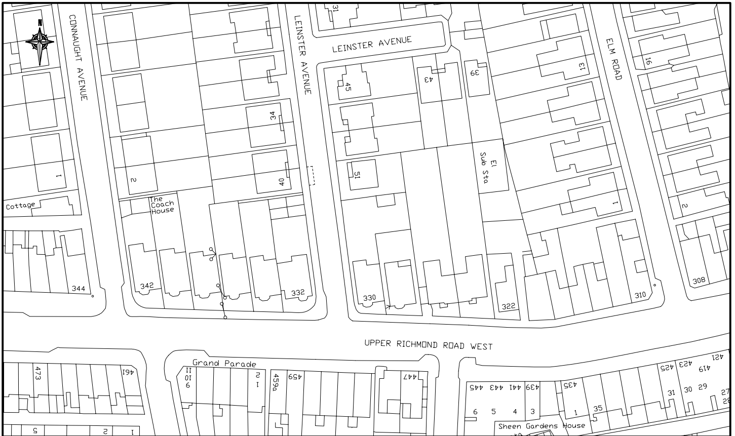
LOCATION PLAN - SCALE 1:1250