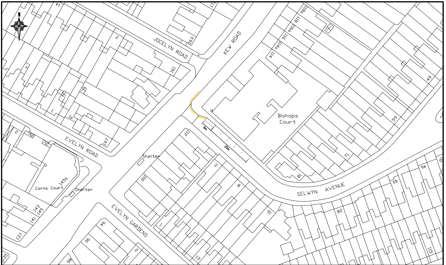
LOCATION PLAN—SCALE 1:1250