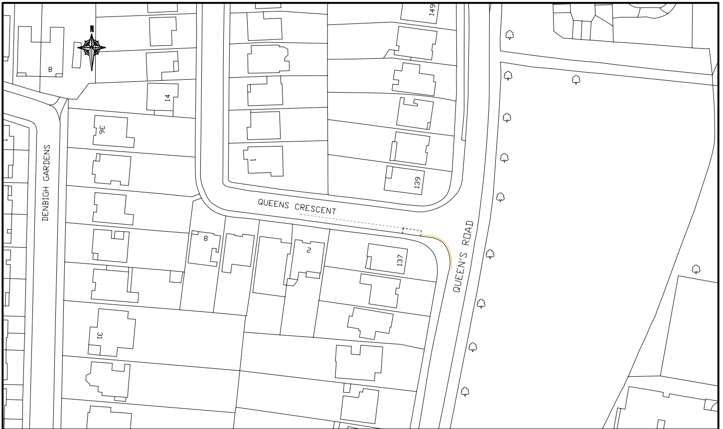
LOCATION PLAN-SCALE 1:1250