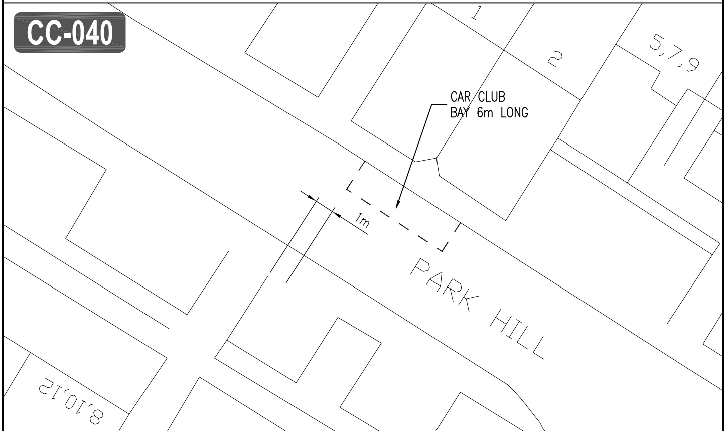
DETAIL PLAN – SCALE 1:200