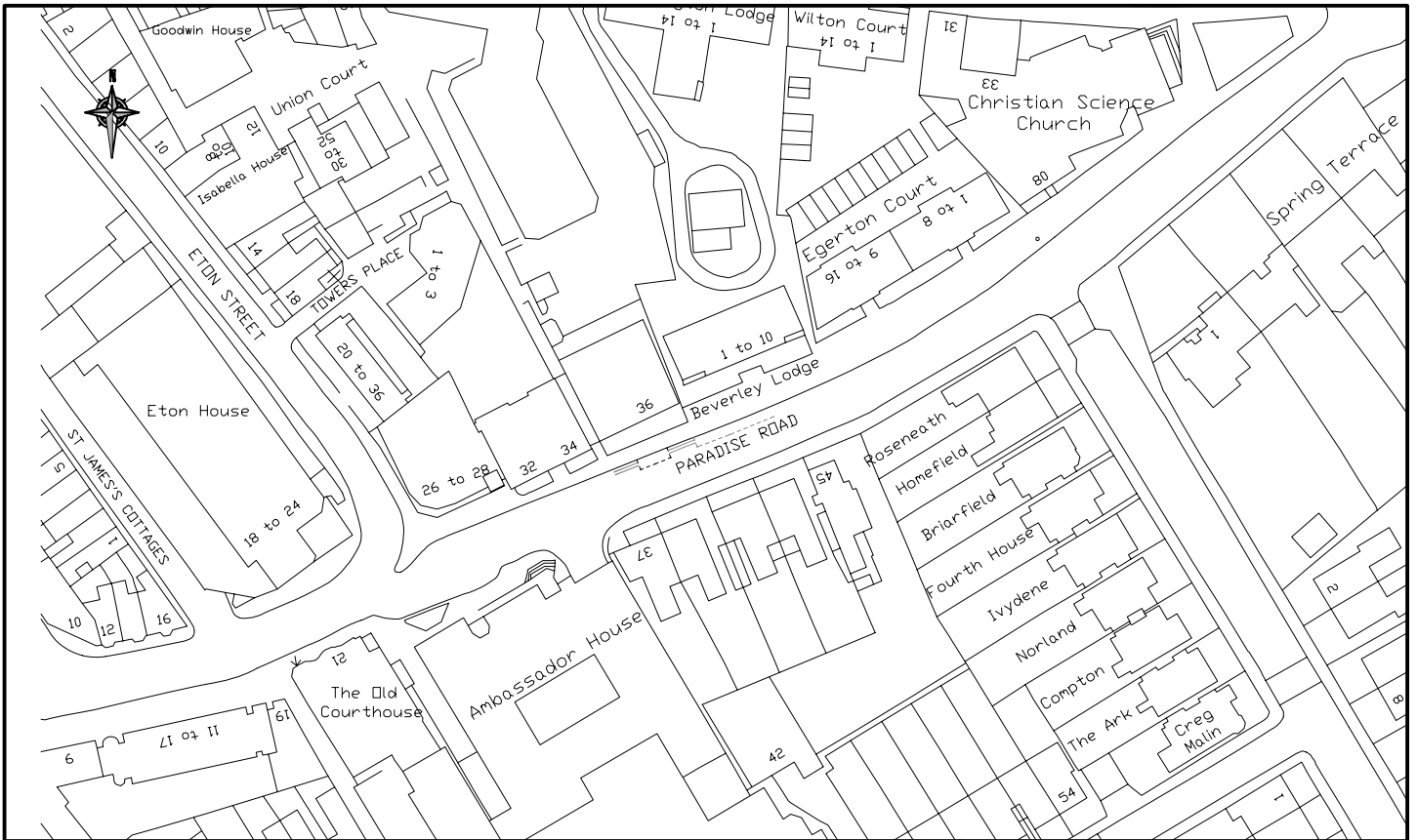
LOCATION PLAN - SCALE 1:1250