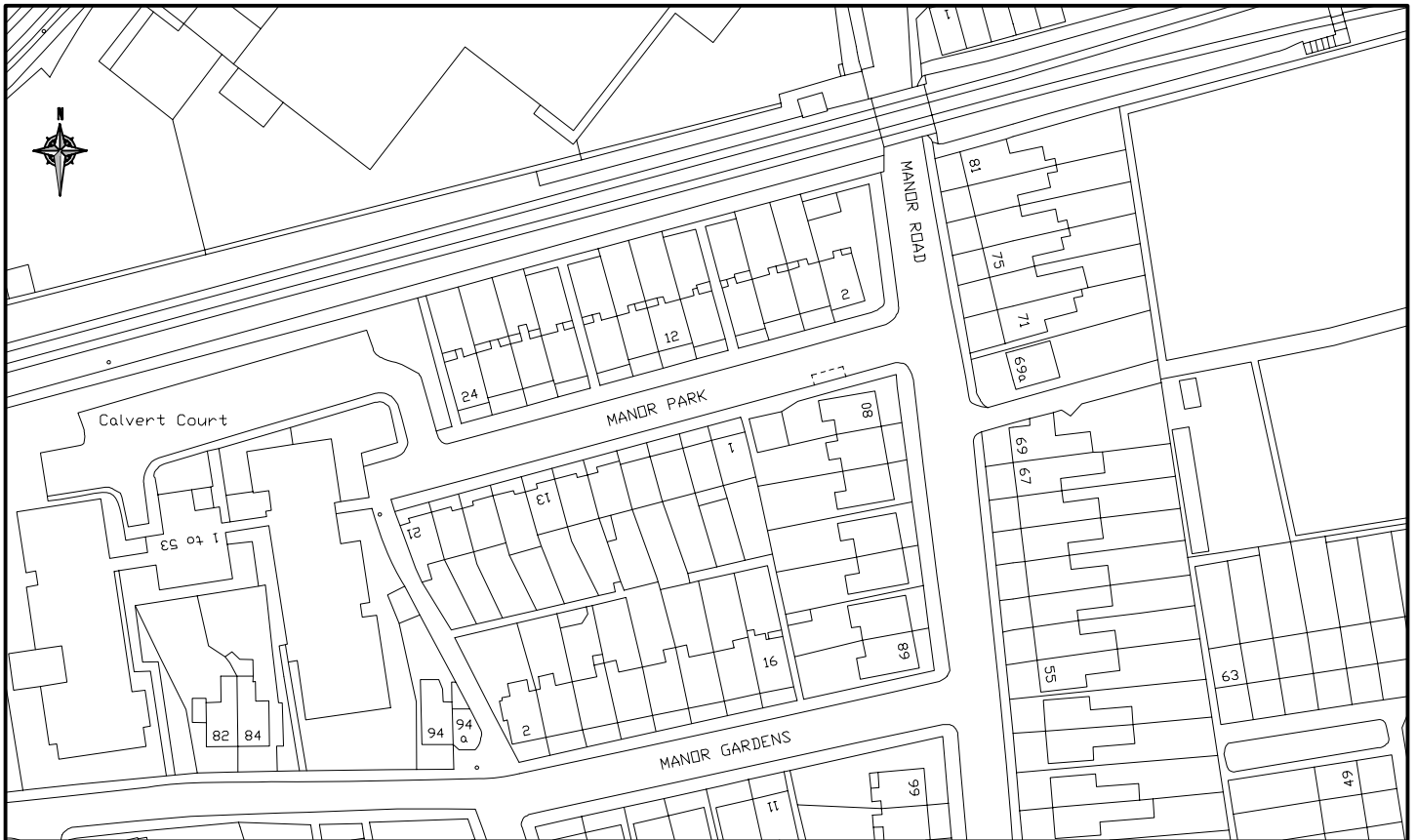
LOCATION PLAN-SCALE 1:1250