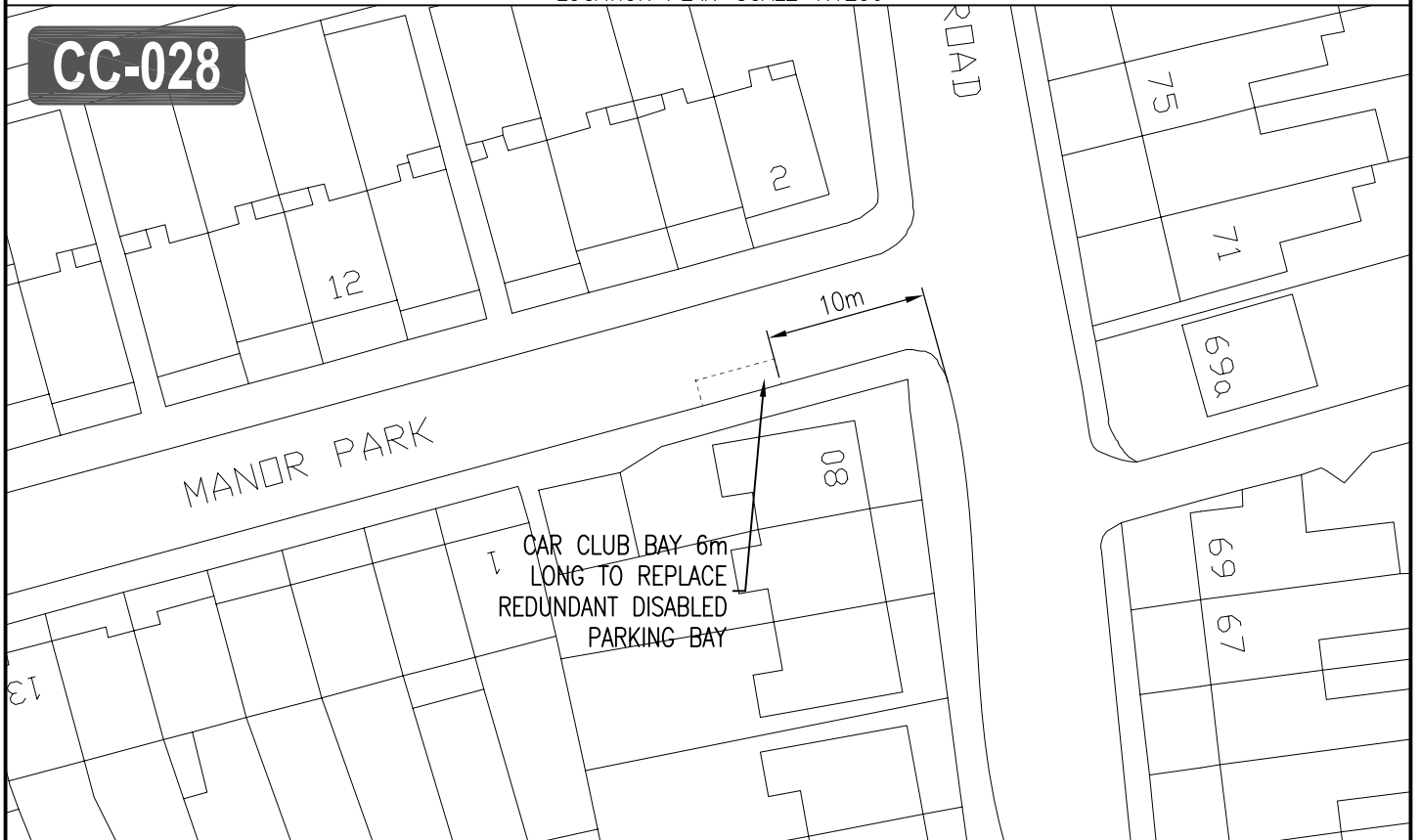
DETAIL PLAN - SCALE 1:500