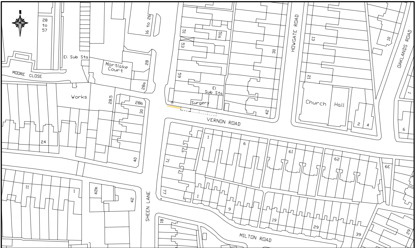
LOCATION PLAN-SCALE 1:1250