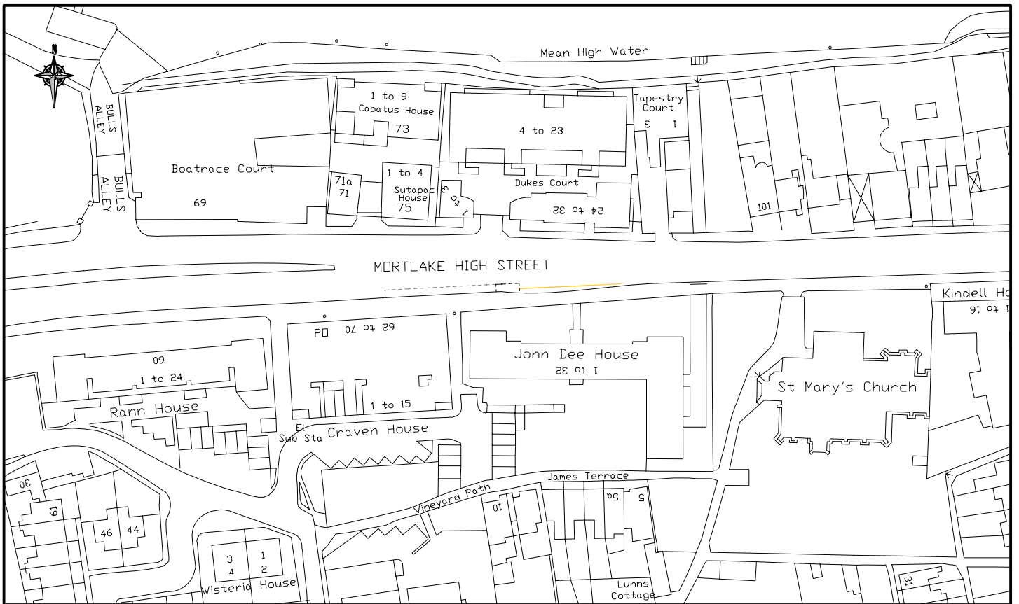
LOCATION PLAN - SCALE 1:1250