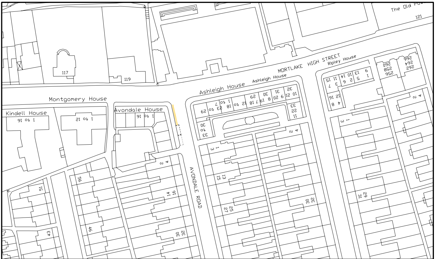
LOCATION PLAN - SCALE 1:1250