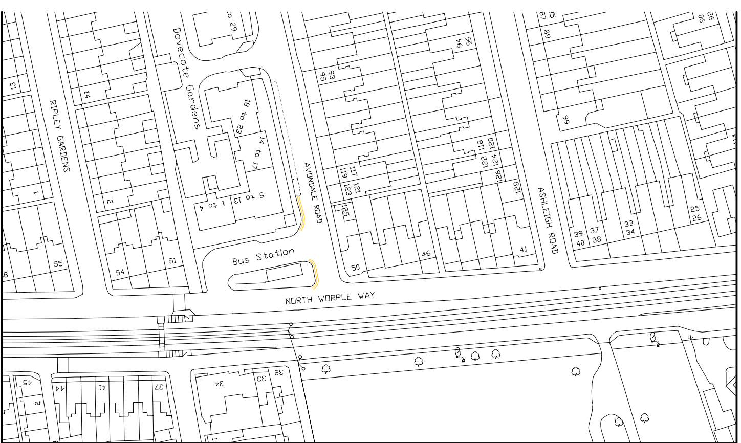
LOCATION PLAN—SCALE 1:1250